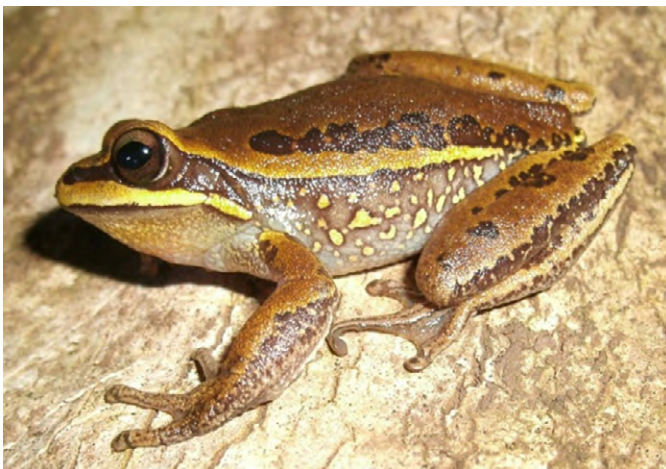
Figure 2. Hypsiboas curupi from the municipality of Casca, Rio Grande do Sul, Brazil.

species, Decree No. 51.797 of September 2014 (GOVERNO DO ESTADO DO RIO GRANDE DO SUL 2014), it is classified as Endangered. Hypsiboas curupi appears in areas of semideciduous seasonal forest and Araucaria forests within the Atlantic Forest domain (GARCIA et al. 2007).