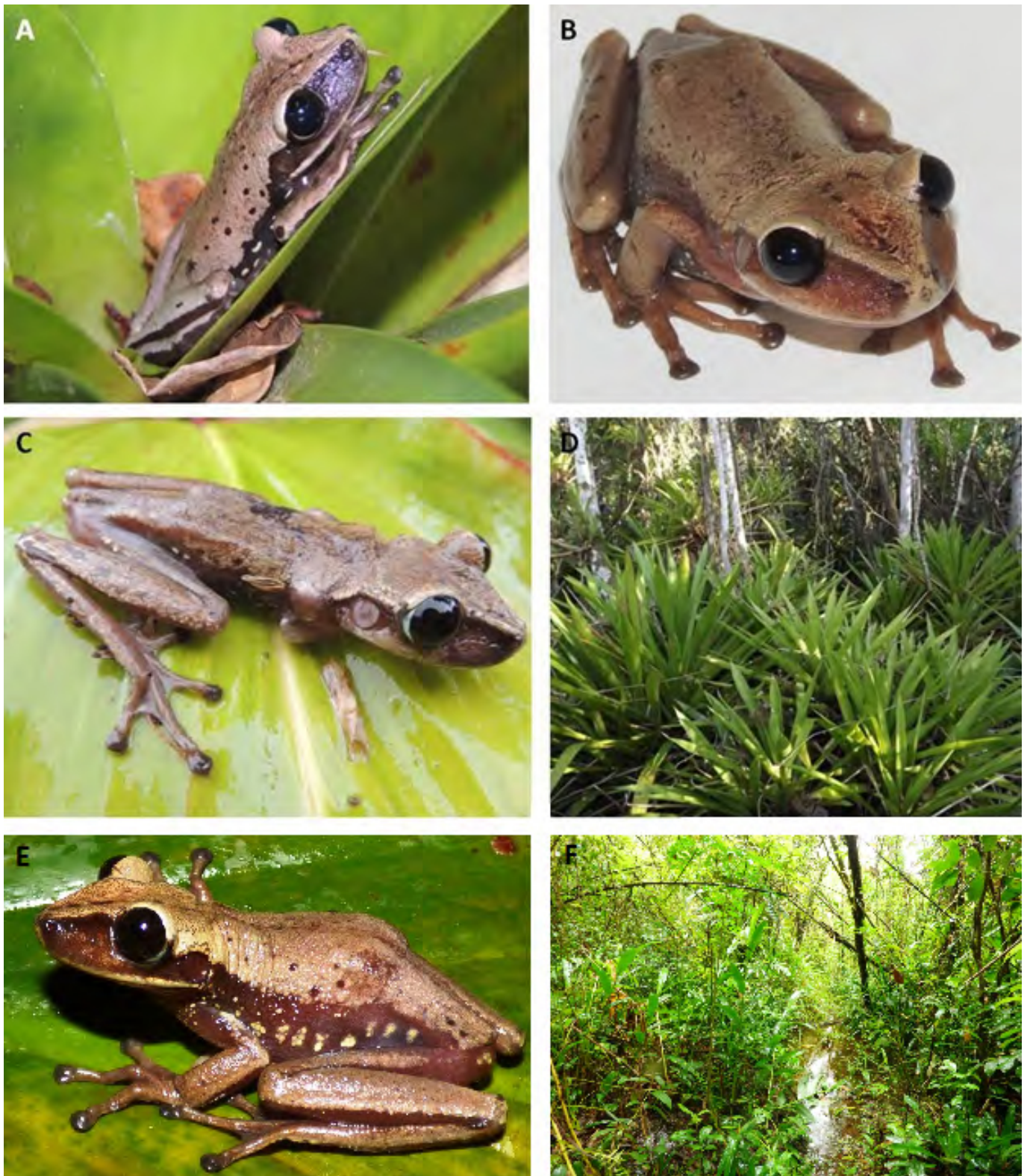
Figure 2. Collected specimens of A. bokermanni from Santa Catarina. A. Juvenile (CHUFSC 3041, SVL 35.1 mm). B–C. Adult females (CHUFSC 3043, SVL 58.9 mm; CHUFSC 3298, SVL 52.1 mm, specimen found without an arm). D. Edge of the restinga fragment with high density of large bromeliads. E. Male from Joinville (CHUFSC 3425, SVL 55.05 mm). F. Fragment of swamp forest.

Furthermore, the individual was found in swamp forest, which may imply that the species can occur in other areas beyond restinga fragments.