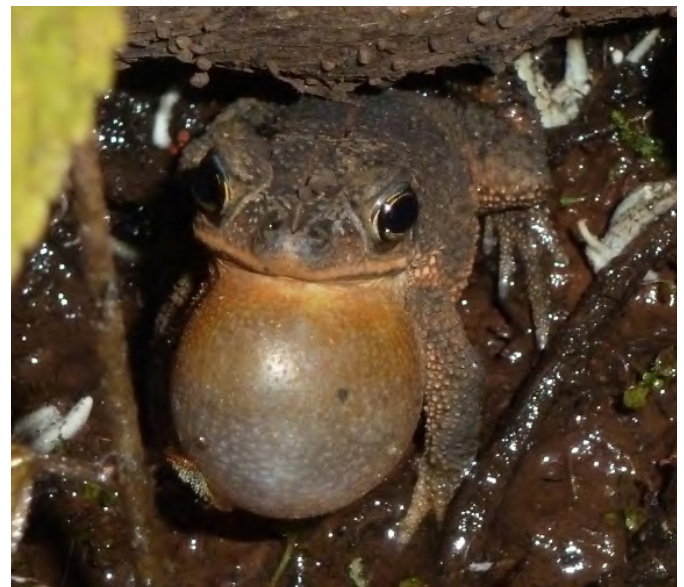
Figure 1. Male Rhinella mirandaribeiroi vocalizing on moist soil on 13 November 2013, at São Joaquim da Barra municipality, São Paulo state, Brazil.

provided by the Centro de Manejo de Fauna Silvestre/ Departamento de Fauna/Coordenadoria de Biodiversidade e Recursos Naturais/Secretaria do Meio Ambiente do Estado de São Paulo) and housed at the Coleção Célio F. B. Haddad (CFBH 36923: SVL 42.9 mm; CFBH 36924: SVL 43.1 mm). The individuals were observed vocalizing at night on moist soil (Figure 1) on 13 November 2013, in transitional areas between degraded native riparian vegetation (Semideciduous Seasonal Forest, Embaúba Stream) and reforestation areas with native seedlings (Pequena Central Hidrelétrica Anhanguera small hydroelectric power plant reservoir, Sapucaí-Mirim River) (20°30'20.22" S, 047°52'32.87" W, 540 m above sea level), located in the municipality of São Joaquim da Barra, in the Sapucaí-Mirim/Grande river basin, northeastern region of the São Paulo state, Brazil.