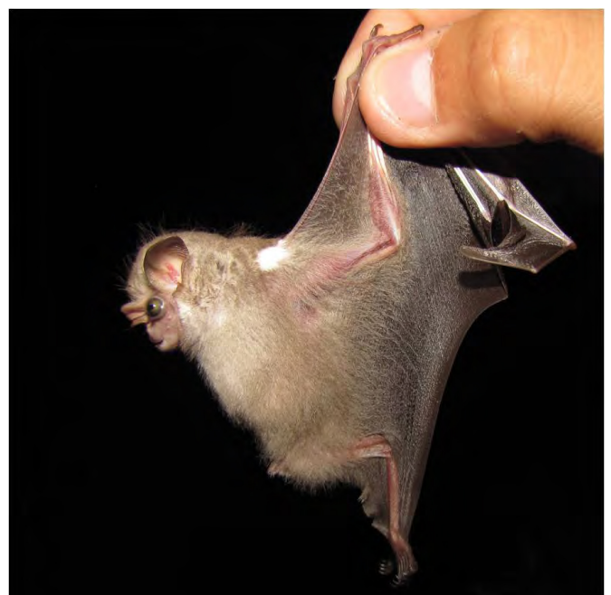
FIGURE 1. Female Sphaeronycteris toxophyllum (MHNJCM-001) collected at Village Cedeño, Boyacá, Colombia.

We captured S. toxophyllum at 22:30 h in a ground-level mist net set in an area of secondary vegetation, consisting of shrubs and herbs. Large woodlands and some open areas with farming and cattle breeding are also present in the region, which is commonly called the Andean foothills. According to Holdridge et al. (1971), the vegetation in this region is the tropical wet forest (Bh-T). Data compiled by Rodríguez and González (2012) show that S. toxophyllum can be found not only in preserved ecosystems, but also in disturbed areas, as recorded here.