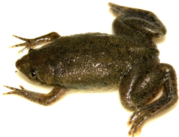
FIGURE 1. Pipa carvalhoi (C00177), State Conservation Unity Monumento Natural Grota do Angico, state of Sergipe, Brazil.

We report the first record of Pipa carvalhoi (Figure 1) for the state of Sergipe, Brazil. The observation occurred on February 25, 2011, in the State Conservation Unit Monumento Natural Grota do Angico (9°39'50" S, 37°40'57" W; 200 m above sea level) (Figure 2), municipality of Poço Redondo. The specimen of Pipa carvalhoi (SVL: 38.16 mm) was collected in a temporary pond in an anthropic environment, with many grasses, near a rocky outcrop. The collected specimen was fixed in 10% formalin and preserved in 70% alcohol, and deposited in the Herpetological Collection of the Universidade Federal