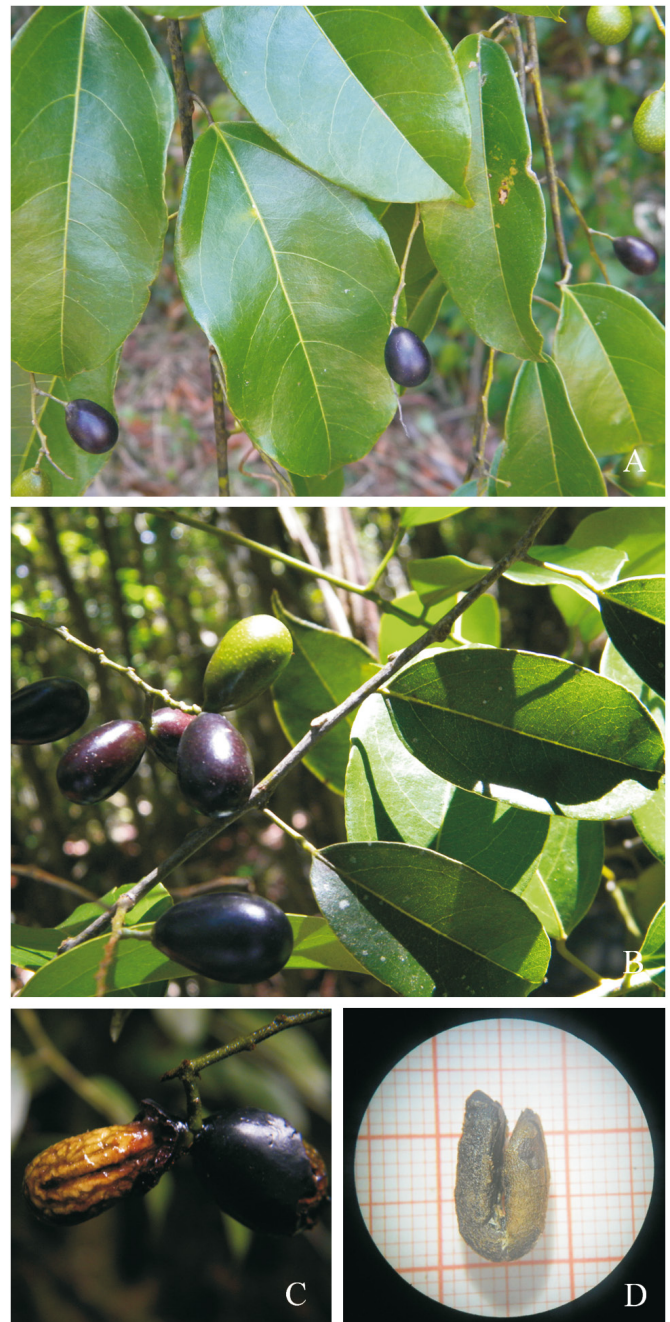
FIGURE 2. Hyperbaena domingensis (DC.) Benth. A. General habit of the branch; B. Inflorescence with mature and immature fruits; C. Detail of dehiscence with mature and immature fruits; D. Detail of horseshoe-shaped seed.