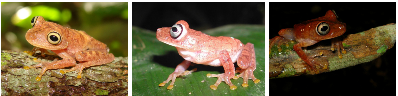
FIGURE 1. Hypsiboas microderma. Lateral views showing the distinctive characteristic of the yellow discs on the fingers and toes. A) specimen from Fazenda Experimental Catuaba, Municipality of Senador Guiomard, state of Acre (not collected); B) specimen from Divisor, Departamento Loreto, Peru (not collected); C) specimen from Estação Ecológica do Cuniã, municipality of Porto Velho, state of Rondônia (UFRO-H 000586).