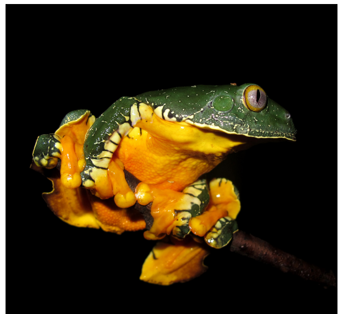
FIGURE 1. Adult male of Cruziohyla craspedopus .

On 30 November 2010 an adult male Cruziohyla craspedopus (Figure 1) was found vocalizing on a large leaf of Caranaí palm ( Lepidocaryum tenue Mart.) at the Estação Ecológica do Cuniã (08°06'23.4" S 63°28'59.9" W, 87 m above sea level) (Figure 2) ca. 180 cm above a temporary pond located in the grid of the ‘Programa de Pesquisa em Biodiversidade’ (PPBio). The specimen was collected and has been deposited in the Coleção de Referência da Herpetofauna do Estado de Rondônia (UFRO-H 000720) of