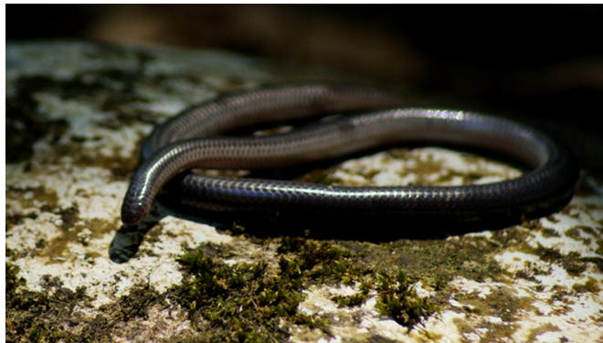
FIGURE 1. Adult male of Tricheilostoma salgueiroi (MNRJ 20088, SVL = 263 mm), collected at Lagoa de Cima, municipality of Campos dos Goytacazes, Rio de Janeiro state, southeastern Brazil.

ICM 21619-2). The snake was found already dead, on a rock in the middle of a rill, in Atlantic Rainforest. This new locality is ca. 40 km SE from the closest known locality for the species and corresponds to its easternmost locality in the state of Rio de Janeiro, filling a gap on the species' distribution (Figure 2).