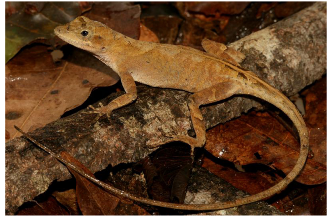
FIGURE 3. Adult female (CRIB 0700) of Anolis chrysolepis captured at the Estação Ecológica de Bauru, municipality of Bauru, state of São Paulo, Brazil.