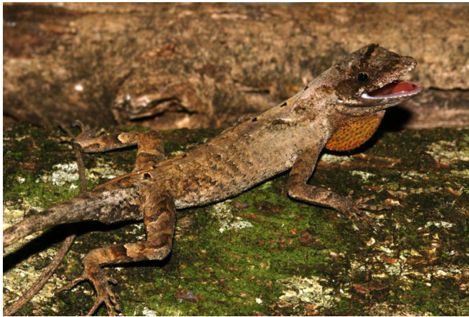
FIGURE 2. Adult male (CRIB 0699) of Anolis chrysolepis captured at the Estação Ecológica de Bauru, municipality of Bauru, state of São Paulo, Brazil.

Specimens collected at the Estação Ecológica de Assis, municipality of Assis, and Estação Ecológica de Bauru, municipality of Bauru (collection permit SISBIO-IBAMA nº 10423-1) are deposited in the Coleção Herpetológica “Alphonse Richard Hoge”, Instituto Butantan (IBSP), state of São Paulo, Brazil (Table 1).