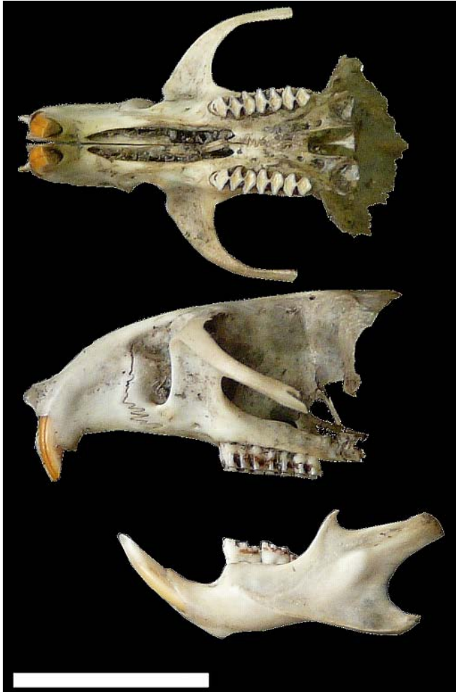
FIGURE 1. Fragmentary skull in ventral (above) and lateral (middle) view and mandible in labial view (below) of a specimen of Irenomys tarsalis recovered from Barn Owl ( Tyto alba ) pellets from Campo Bonansea, northwestern Chubut Province, Argentina (LIEB-M-41E). Scale bar represents 10 mm.

10. El Palenque, Corcovado (43°37'34.6" S, 71°26'12" W; LIEB-M-717; in unidentified strigiform pellets).