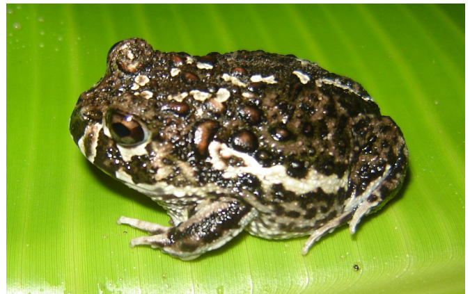
FIGURE 1. Individual of Odontophrynus carvalhoi collected in Mata do Engenho Coimbra, municipality of Ibateguara, state of Alagoas.

The present record of O. carvalhoi represents the nearest location to the Brazilian coast known for this species (ca. 70 km from the coast). The Parque Nacional da Serra da Canastra, in southwestern state of Minas Gerais, located between the municipalities of São Roque de Minas, Sacramento, and Delfinópolis, in the region of headwaters of the São Francisco river (20°10' S, 46°30' W, 1,350 m elevation), represents the extreme meridional limit of the known geographic distribution of O. carvalhoi (ca. 1,700 km south from the type locality) (Haddad et al. 1988).