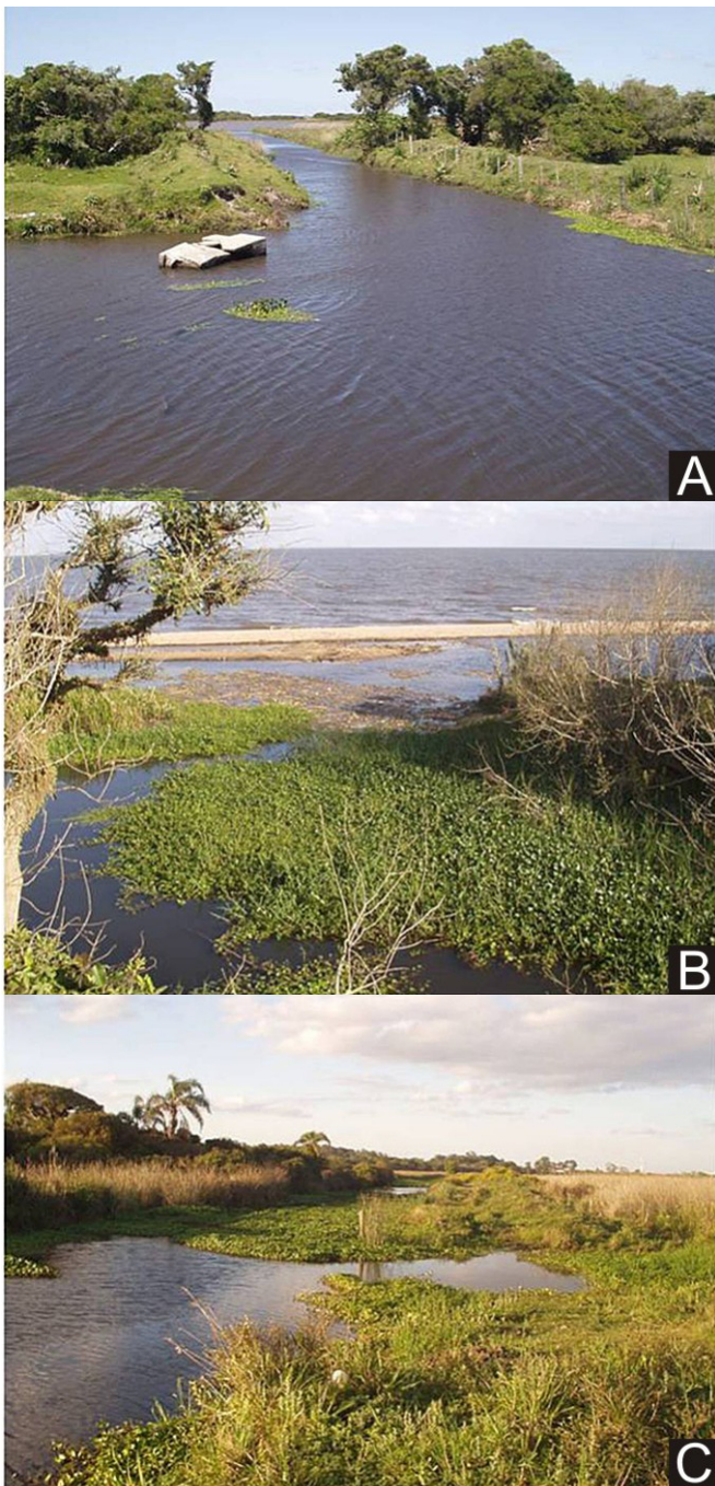
FIGURE 3. Sampling sites of Dormitator maculatus in the municipality of Pelotas, Patos-Mirim lagoon system, RS. (A) Sampling site changed by drainage works bathed in Pontal da Barra swamps; (B) Totó stream; (C) Salgado-Sujo stream.

Although D. maculatus has a wide distribution (see Froese and Pauly 2010), the species occurs only in a limited range near the sea, one of the regions that is suffering the most from the impacts of human occupation, such as change and pollution of water bodies, deforestation and land divisions (Abilhoa and Duboc 2004). Due to the fact that this species was rarely collected in the state of Paraná and anthropic changes have been recorded in its habitat, D. maculatus was included in the red list of threatened fauna of the state of Paraná (Abilhoa and Duboc 2004). In Rio Grande do Sul, although the species was recorded in a protected area, the Parque Nacional da Lagoa do Peixe (Loebmann and Vieira 2005), there are few records their populations and several publications in the coastal plain of the Rio Grande do Sul, including those with long-term sampling, have not recorded the presence of this species (e.g. Tagliani 1994; Garcia and Vieira 2001; Garcia et al. 2006). In addition, the populations of the Patos-Mirim lagoon system recorded in the present study suffers the same threats that populations from the state of Paraná. Therefore, it is possible that D. maculatus might be considered a species threatened with extinction in the state of Rio Grande do Sul.