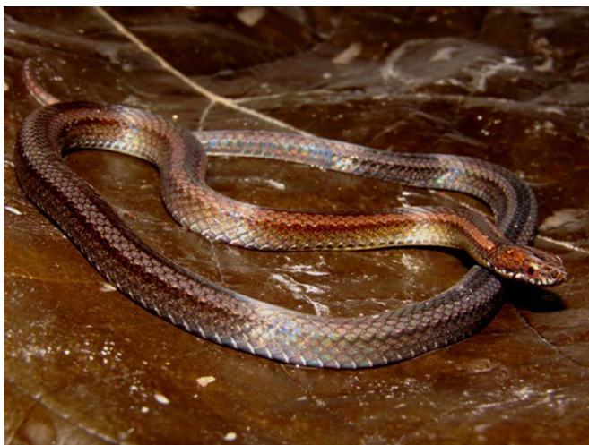
FIGURE 1. Live specimen of Taeniophallus brevirostris (UFMT 6855) from Aripuanã, state of Mato Grosso, Brazil.

firme” areas (non-flooded) in tropical forests (Santos-Jr. et al. 2008). Here we report a new Brazilian state record for T. brevirostris , improving our knowledge of its geographic distribution.