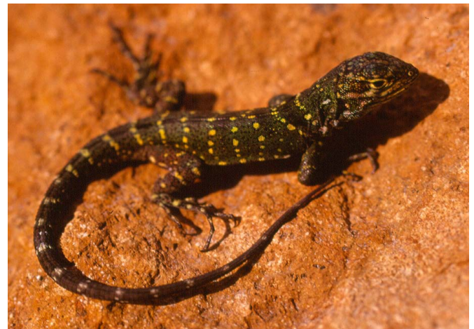
FIGURE 3. Dorsolateral view of juvenile male of Stenocercus humeralis (CORBIDI 00936) collected at Cerro Yantuma, Ayabaca, Peru.

This new record extends the known species' distribution ca. 78.5 km SW from the southernmost record at 12.2 km south of Loja (Malacatos River Valley on road to Vilcabamba; Torres-Carvajal 2007a) (Figure 4). Stenocercus humeralis was not reported by Carrillo and Icochea (1995) or Lehr (2002) in their lists of reptiles from Peru.