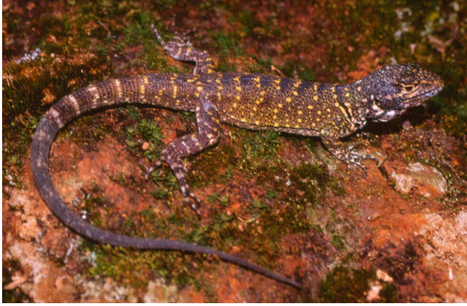
FIGURE 4. Dorsolateral view of adult male of Stenocercus humeralis (CORBIDI 00940) collected at Cerro Yantuma, Ayabaca, Peru.

ACKNOWLEDGMENTS: Fieldwork was made possible by Nature & Culture International (NCI) in Peru. Karen Siu-Ting provided the map and Jeremy Flanagan reviewed the manuscript.