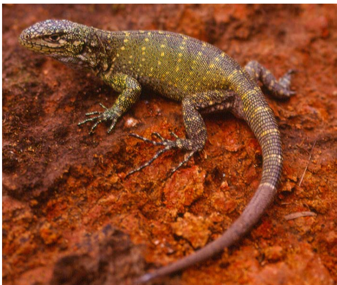
FIGURE 2. Dorsolateral view of adult female of Stenocercus humeralis (CORBIDI 00939) collected at Cerro Yantuma, Ayabaca, Peru.

Stenocercus humeralis was considered as restricted to the interandean valleys of the Catamayo (Pacific drainage) and Zamora rivers (Atlantic drainage), at elevations between 2,000-3,000 m, province of Loja, southern Ecuador (Torres-Carvajal 2000; 2007a; 2007b).