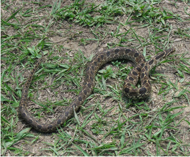
FIGURE 2. Tomodon orestes (FML 23135), adult male from Vallecito, Santa Victoria departament, Salta province, Argentina.

province but subsequently was discarded by other authors (Giraudó 2001; Scrocchi et al. 2006).