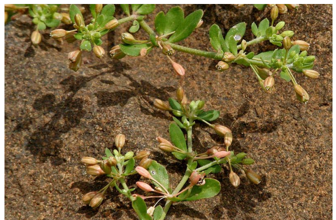
FIGURE 5. Glinus oppositifolius (L.) A. DC.