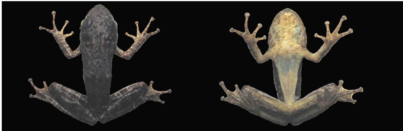
FIGURE 2. Dorsal (A) and ventral (B) view of an adult female Scinax centralis (MZUFV 6511, 26.55 mm snout-vent length) from Campo Alegre de Goiás, state of Goiás, Brazil.