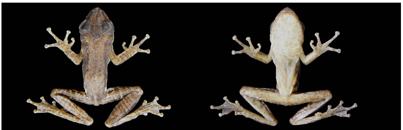
FIGURE 1. Dorsal (A) and ventral (B) view of an adult male Scinax centralis (MZUFV 6509, 22.05 mm snout-vent length) from Campo Alegre de Goiás, state of Goiás, Brazil.

Scinax centralis is distinguished from other closely related species by its small size (SVL 17.8-21.2 mm). This species is also characterized by the presence of developed inguinal glands, snout slightly protruding in lateral view and the presence of a triangular interocular blotch (Pombal and Bastos 1996). Adult females of Scinax centralis (Figure 2) present the same characteristics of males related in the description (Pombal and Bastos, 1996). Females also have inguinal glands and the same patterns of dorsal coloration, and tend to be larger than males (Table 1). Besides the sexual dimorphism reported by Alcantara et al. (2007), two of our four males were larger in SVL than those reported in the original description (larger reported male had 21.2 mm) and also those reported by Alcantara et al. (2007) (males SVL reached 17.05-23.45 mm).