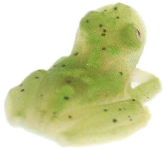
Figure 1. Hyalinobatrachium iaspidiense in life.

In Ecuador, Hyalinobatrachium iaspidiense is known from a single locality (Totoa Nai'qui, territory of Cofán-Dureno, province of Sucumbíos; 0°02'3.91" S, 76°45'10.01" W, ca. 280 m). In this study, we report a new record of H. iaspidiense from Ecuador and provide a characterization of the habitat where this rare species was found. Also, we report the results of a DNA-based test for chytridiomycosis.