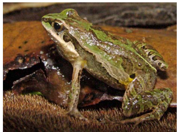
Figure 1. Adult male of Physalaemus jordanensis from Parque Estadual da Serra do Papagaio, municipalities of Alagoa and Aiuruoca, state of Minas Gerais, Brazil.

Physalaemus jordanensis is considered as “Data Deficient” in the latest revisionary work on threatened species of fauna of Minas Gerais (Biodiversitas 2007), in the compilation of threatened amphibians of the world (Stuart et al. 2008), and in IUCN Red List, due to lack of information on range of occurrence, conservation status and ecological requirements (Nascimento and Verdade 2004). In the latest list of threatened species of fauna of state São Paulo, P. jordanensis is considered as “Near Threatened” (SMA 2008).