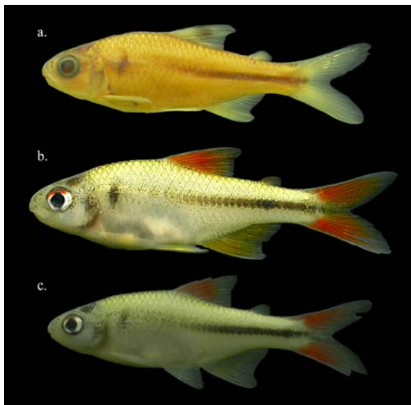
Figure 2. Morphologic and chromatic variation in different populations of Creagrutus melasma from Venezuela: a) Paratype MCNG 24622, 29.8 mm SL, Caño la Comarca, Carabobo State; b) CPUCLA 1986, 33 mm SL, Hueque river sector Colombia, Falcón State; c) CPUCLA 1243, 27.4 mm SL, Ricoa river sector San Pablo, Falcón State.

Physical and chemical data from the sites where C. melasma was captured are show in Table 1. Riverbanks at collection sites usually had been partially deforested, with bands of native vegetation 6-12 m wide, and some showing signs of erosion. Although drainage patterns have not suffered changes in most places sampled, human impacts of agriculture as well as dredging for channelization are present (Rodríguez et al. 2005).