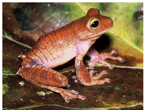
Figure 1. Adult live male of Bokermannohyla ibitipoca from Pedra Azul, municipality of Domingos Martins, state of Espírito Santo, Brazil.

Recently, the hylid frog Dendropsophus ruschii was rediscovered from Pedra Azul (Peloso and Gasparini 2006), in the same place where we observed B. ibitipoca . This mountainous region is located in the Atlantic Rainforest domain, characterized by high levels of endemism, including at least 14 endemic species of frogs (Pombal Jr. et al. 2003; Cruz and Feio 2007).