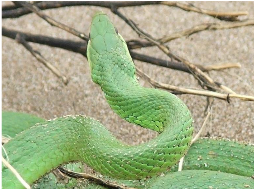
Figure 2. Detail of specimen's cephalic scales.