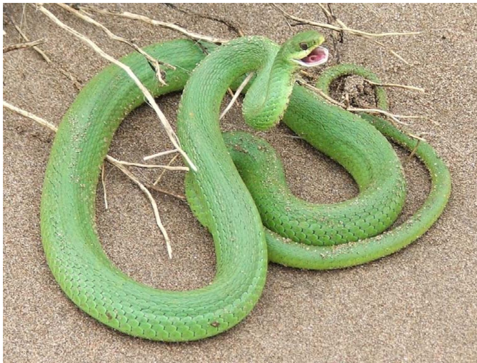
Figure 1. Green snake ( Philodryas aestivus ) found at the mouth of river Quequén Salado, Buenos Aires.

In spring of 2006, we found an adult green snake (Figures 1 and 2) in the Atlantic coastal zone of southern Buenos Aires (Figure 3), ca. 170 km southeast from its previously known southernmost distribution area of Sierra de La Ventana. We observed the specimen on a bare-soil sandy plain at the Quequén Salado River mouth (38°55'44.43" S, 60°30'42.02" W), next to a marine beach, 5 km east from Marisol village (Partido de Coronel Dorrego). Due to lack of authorization for specimen collection, we photographed the snake with a high resolution digital camera, which made possible its determination as a Philodryas aestivus . The pictures are stored in the Museum of Natural Sciences of La Plata (cf. 0047-0050).