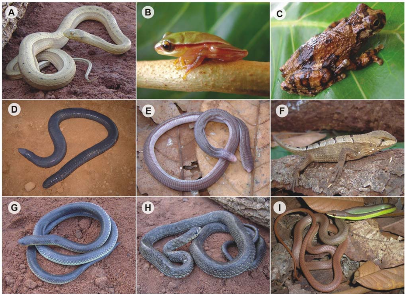
Figure 2. Representatives of some of the amphibians and reptiles recorded at the UHE Espora. A, Thamnodynastes hypoconia ; B, Dendropsophus jimi ; C, Dendropsophus soaresi ; D, Siphonops paulensis ; E, Cercolophia roberti ; F, Stenocercus sinesaccus ; G, Atractus albuquerquei ; H, Philodryas patagoniensis ; I, Philodryas mattogrossensis .