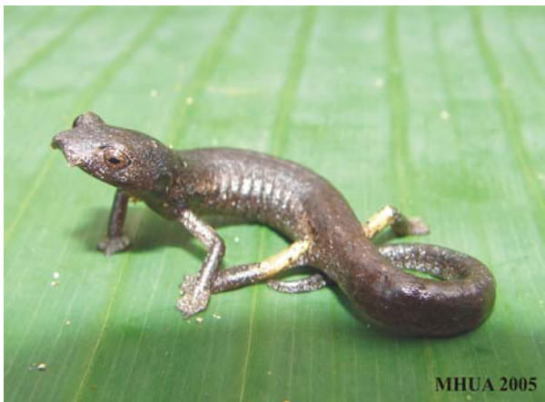
Figure 1. Adult of Bolitoglossa medemi (MHUA 4304) from Coquí River, town of Coquí, Nuquí municipality, Department of Chocó, Colombia.

Bolitoglossa medemi Brame and Wake (Figure 1) is a small arboreal plethodontid salamander inhabiting humid lowland forest, recorded below 600 m above sea level, and it is found in disturbed habitats (Solís et al. 2004). This species has previously been reported from the Río Arquía (Vigía del Fuerte municipality), Department of Antioquia, from Río Opopadó and Río Napipí (Bojayá municipality), and northern flank of Alto del Buey (Riosucio municipality), Department of Chocó (Figure 2), both in the Chocoan region of western Colombia (Brame and Wake 1972; Lynch and Suárez-Mayorga 2004).