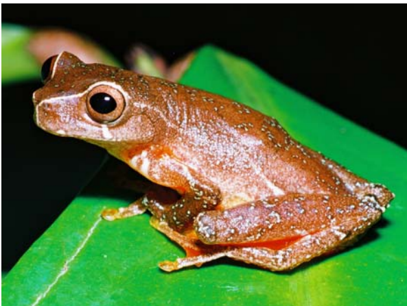
Figure 1. Adult specimen of Dendropsophus ruschii from Pedra Azul, Domingos Martins, Espírito Santo state, Brazil. CFBH 10584.

Ruschi's treefrog, Dendropsophus ruschii (Figure 1), is a species endemic to the Atlantic Rainforest in the Espírito Santo state, southeastern Brazil. All known specimens were collected in this forest formation, at elevations around 800 m (Weygoldt and Peixoto 1987; Frost 2004).