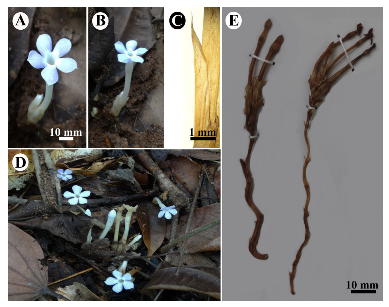
Figure 2. Voyria caerulea Aubl. (A.W.C. Ferreira et al. 251, MAR 9284). A. Flower in frontal view. B. Flower in lateral view. C. Detail of a leaf from a dried herbarium specimen. D. Flowering plants in their habitat. E. Detail of a flowering plant in a dried herbarium specimen.