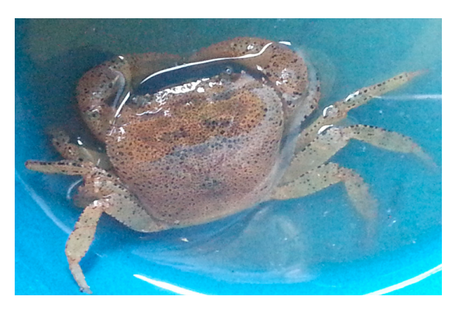
Figure 1. Oziothelphusa mineriyaensis male from Mihintale Sanctuary, North Central Province, Sri Lanka (SW/FC 021).

limited only to 2 location (Anuradhapura, North Central Province) other than the type locality (Ng and Tay 2001, Bahir and Yeo 2005, Bahir et al. 2008). Here, we report 5 new localities for O. mineriyaensis from the North Central Province of Sri Lanka, which add significantly to the known geographic distribution of this species. New records of endemic species, such as reported here, are important for biodiversity conservation.