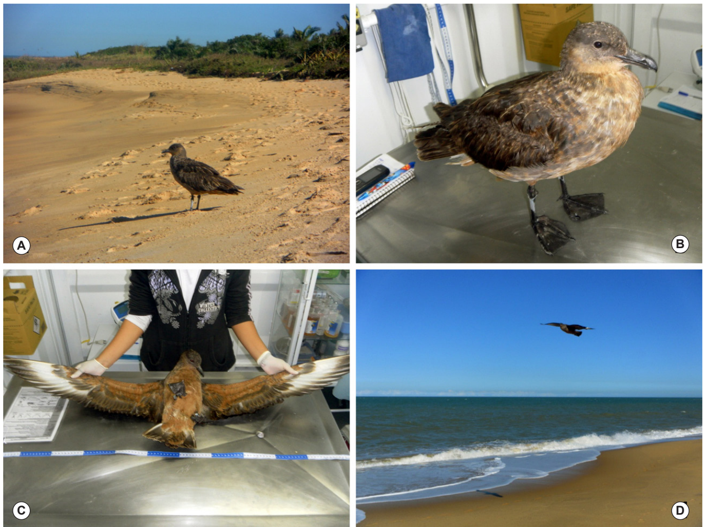
FIGURE 2. Details of Chilean skua S. chilensis found in the state of Espírito Santo, southeast Brazil: a) bird at Ubu beach, Anchieta municipality, on 4 July 2011; b) side view of the bird showing the main characteristics of the species: general color of plumage, contrasting cap, and stripes on the side of the neck and mantle; c) individual manipulation for veterinary procedures and biometry; d) bird flying after release on 26 July 2011 at Guanabara beach, Anchieta municipality.