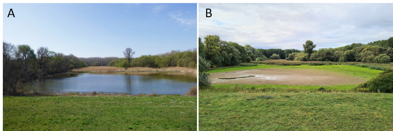
Figure 2. View of the study site. A. The remnant of the oxbow lake Čičov, showing the water-filled stage in the spring. B. The site almost entirely dry in autumn (September 2022).

2). The site is hydrologically unstable and depends on the hydrological regime of the Danube, as it is connected to the river during extreme floods. By autumn the site may partially dry out, with the remaining water forming a pool in the middle of the lake. In 2022 (and previously also in 2018) the site dried completely, and water remained only in a small depression (Fig. 2B). In the spring, the side arm gets reconnected with the main channel of the Danube and fills with water. The structure of the macrophyte community is also driven by this hydrological regime. The bottom of the oxbow lake is covered with submerged aquatic plants, such