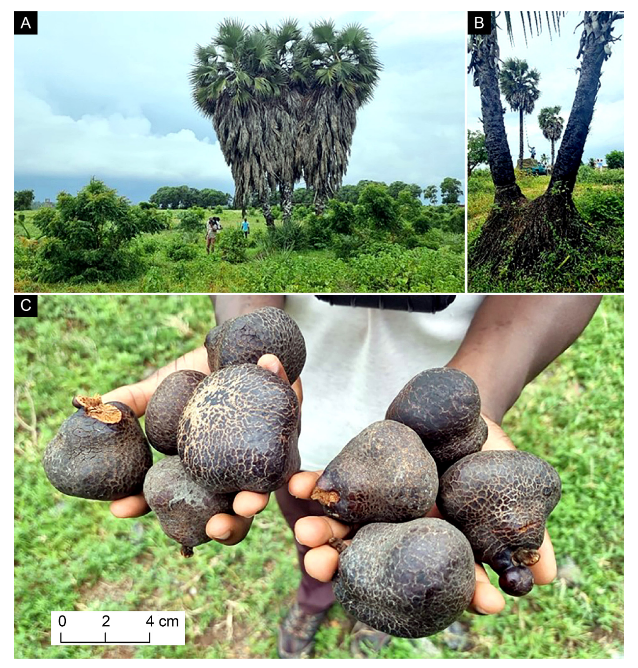
Figure 1. Hyphaene guineensis Schumach. & Thonn. A. Female individual with old, persistent leaves on the stem. B. Stem with adventitious roots; note two individuals germinating from a 3-carpellate fruit. C. Fruits at ripe stage of development.

rachillae bracts 6 mm long, spirally arranged, striate, connate laterally and partially adnate to rachilla and originating pits, spirally arranged on rachilla, each pit containing 3 flowers arranged in a cincinnus; pistillate inflorescences 5 or 6 growing simultaneously, branching to 2 orders, to 1.1 m long, morphologically similar to the male inflorescence; peduncle 35–50 cm long \times 2–3 cm in diameter, circular to elliptical in cross section; prophyll 35 cm long; peduncular bracts 7, to 42 cm long, tubular, covered with a brown-reddish indumentum; rachis 0.7–1 m long, (1–) 2–4 cm in diameter, elliptical in cross section; at least 1 bract attached to the peduncle, 26 cm long \times 6 cm wide, covered with a wooly indumentum; rachilae 4–6, solitary, rarely in