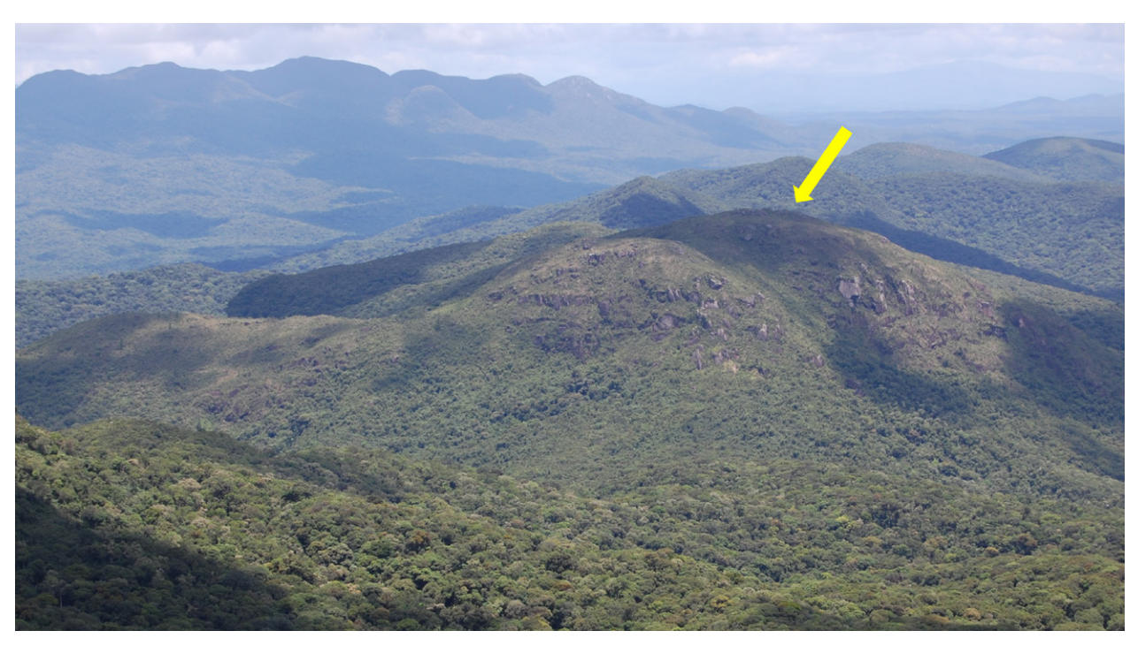
Figure 1. General view of the new locality of record of Brachycephalus coloratus , Pão de Ló, Parque Estadual Serra da Baitaca, municipality of Quatro Barras, Paraná, southern Brazil (yellow arrow), viewed from the top of Anhangava (type locality of B. pernix ).

New record. BRAZIL – Paraná • Quatro Barras, Parque Estadual Serra da Baitaca, Serra da Baitaca, Pão de Ló; 25°24′45″S, 048°59′58″W; 1,250 m a.s.l. (Fig. 1);