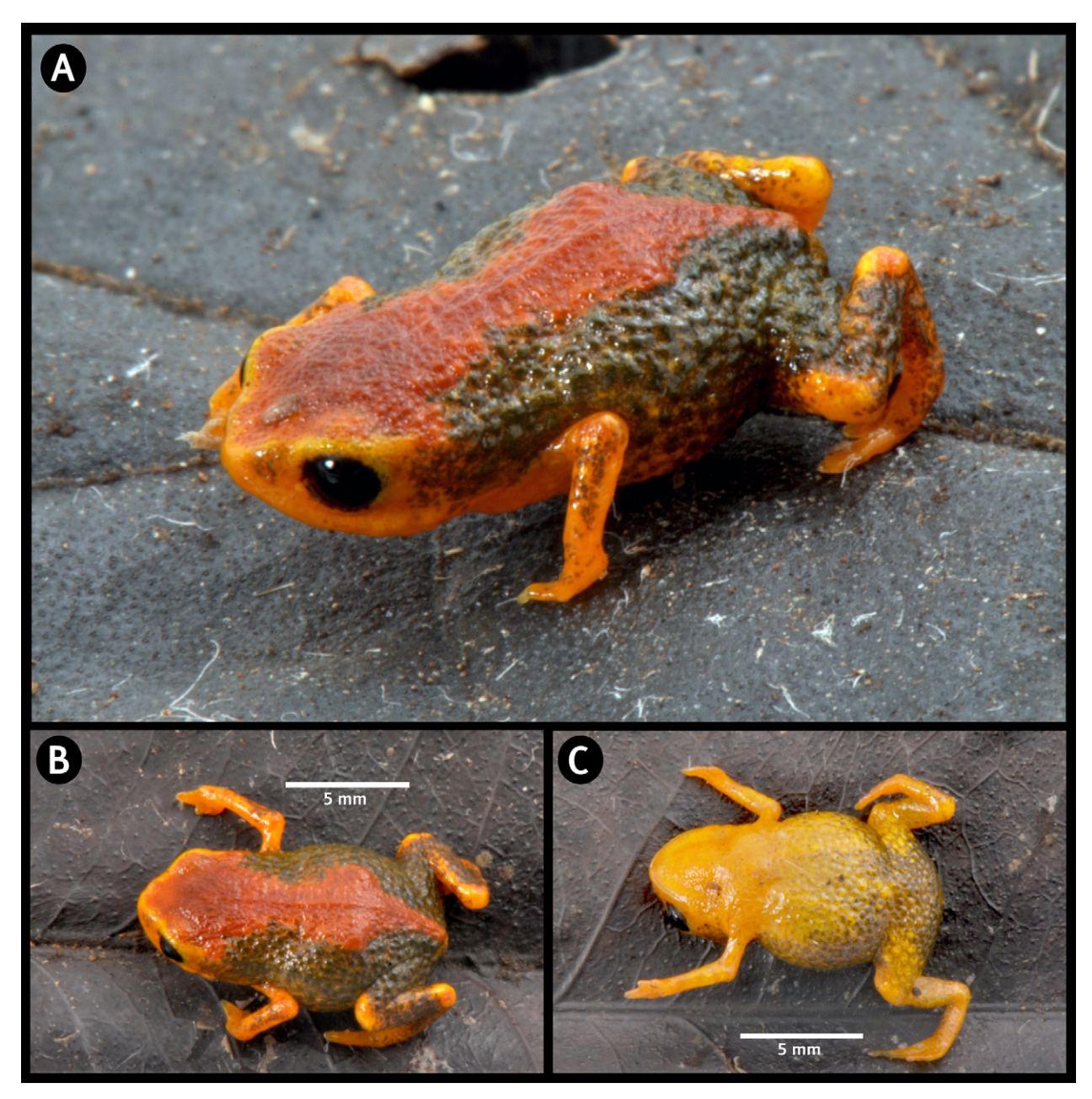
Figure 2. Adult male of Brachycephalus coloratus (MHNCI 11596) collected in Pão de Ló, Parque Estadual Serra da Baitaca, Serra da Baitaca, municipality of Quatro Barras, Paraná, southern Brazil. A. Lateral view. B. Dorsal view. C. Ventral view.

16.XII.2019; Júnior Nadaline, Cristiano Nadaline Gomes, and Larissa Teixeira leg.; 1 ♂; MHNCI 11596 (Fig. 2).