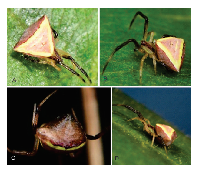
Figure 1. Female of Episinus marignaci from Mphaphuli Cycad Reserve. A , B . Dorsal view. C , D . Dorsolateral and lateral views.

Identification. Total length of female 3-6 mm. Carapace slightly longer than wide; fawn with two dark, V-shaped longitudinal bands; eye region elevated projecting anteriorly (Fig. 1A, B); with a pair of tubercles between anterior and posterior median eyes; anterior eye row slightly recurved; posterior row straight or slightly recurved as seen from above; median eyes closer to laterals than to each other; clypeus low and flat, usually projecting anteriorly; fovea distinct and long. Abdomen reddish brown (Fig. 1D) with distinct triangular pattern dorsally (Fig. 1A-D); dorsal triangle consists of a yellow area bordered by thin reddish band (Fig. 1B); second smaller pink triangle on the yellow triangle, sometimes with yellow transverse bands. Leg formula 1423; legs II and III, same colour as carapace; legs l and IV brown, with dusky flecks and marks or bands. Epigyne with more or less semicircular openings in a depression with a