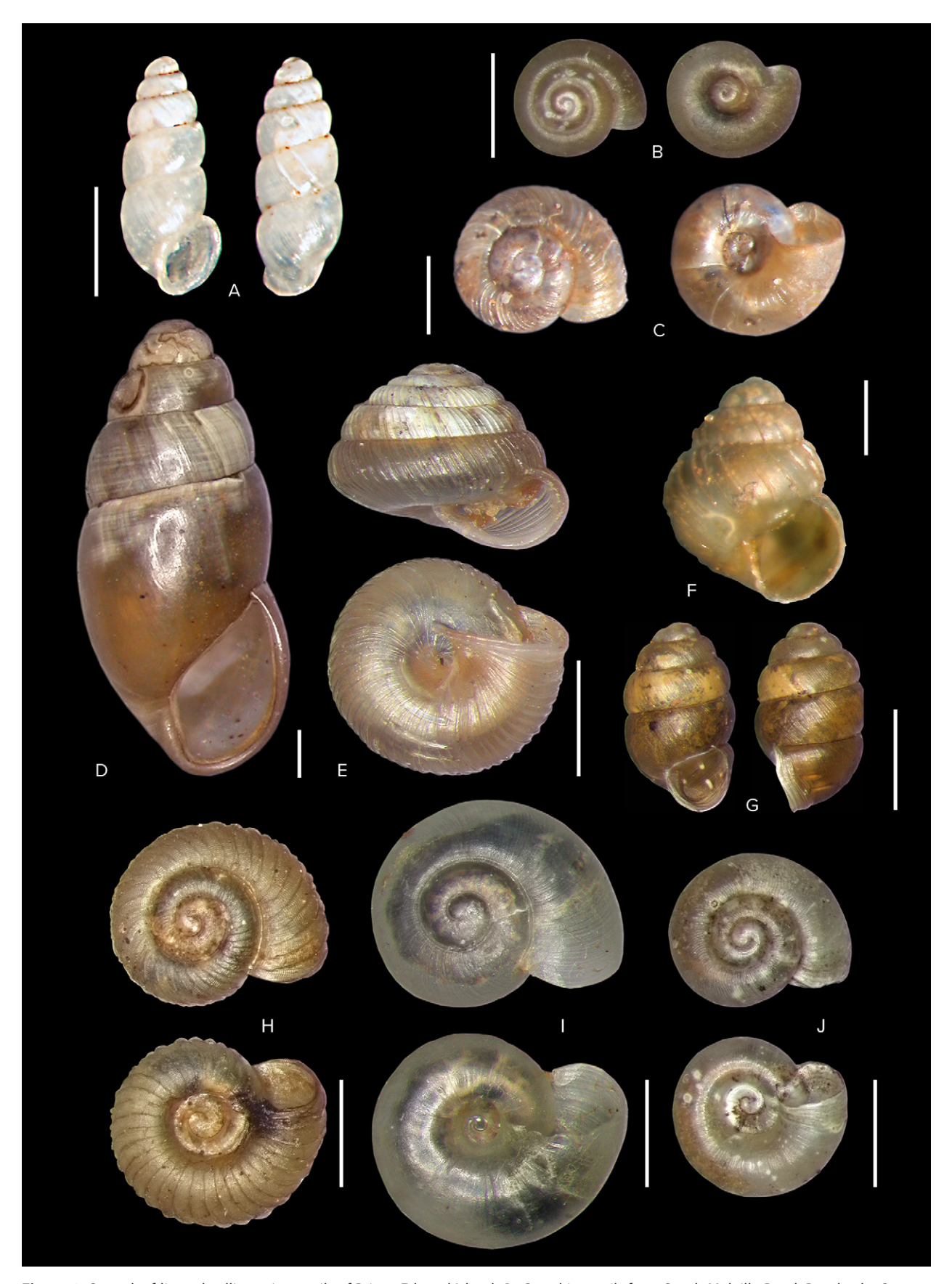
Figure 2. Some leaf-litter dwelling microsnails of Prince Edward Island. A. Carychium exile from South Melville Road, Brookvale, Queens County (NBM-009889). B. Punctum minutissimum from South Melville Road, Brookvale, Queens County (NBM-009895). C. Discus whitneyi from East Point Road, Kings County (NBM-009862), not fully grown. D. Cochlicopa lubrica from Brudenell Provincial Park, Kings County (NBM-009869). E. Strobilops labyrinthicus from South Melville Road, Brookvale, Queens County (NBM-009888). F. Zoogenetes harpa from Mickle Macum Road, Bear River/St. Margaret's, Kings County (NBM-009844). G. Vertigo cristata from Selkirk Road, Queens County (NBM-009887). H. Striatura exigua from North Granville, Queens County (NBM 009850). I. Striatura ferrea from Selkirk Road, Queens County (NBB-009882). J. Striatura milium from North Granville, Queens County (NBM 009849). All scale bars = 1 mm.