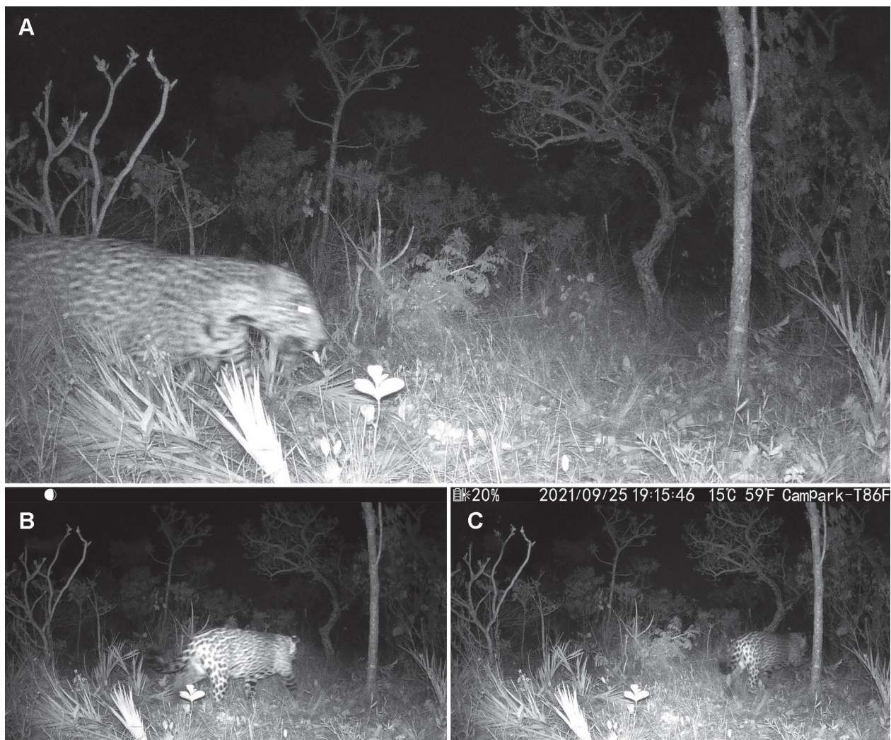
Figure 2. Jaguar, Panthera onca , in Brasília National Park, Distrito Federal, Brazil.

Our study reports a new visual record of a Jaguar within the PNB. This is essential data because it is the first photograph of this species from the original part of the PNB, which is within the administrative area of Brasília