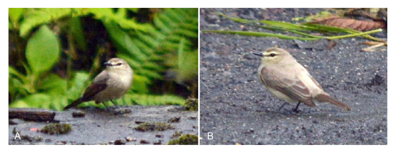
Figure 2. Ochthornis littoralis recorded at 1560 m a.s.l. near the Topo River hydroelectric power plant, Tungurahua, Ecuador. A. Frontal view. B. Side view.

anywhere in its range. The general vegetation in the water-capture area of the hydroelectric plant was typical of the Low Montane Evergreen Forest found on the eastern Andes, which differs considerably from the Evergreen Forest of the Amazonian lowlands and other riparian ecosystems where the bird is usually observed (MAE 2013). Referring to the system of bioclimatic classification used for the Ecuadorian fauna, this species is now known to occupy not only the Oriental Tropical Area but also the Oriental Subtropical Area (Albuja et al. 2012). The habitat at the new locality presents human disturbance and lacks the typical sandbanks of the usual riparian habitats where O. littoralis usually occurs. The vegetation is also lower, and the current in the river is much greater.