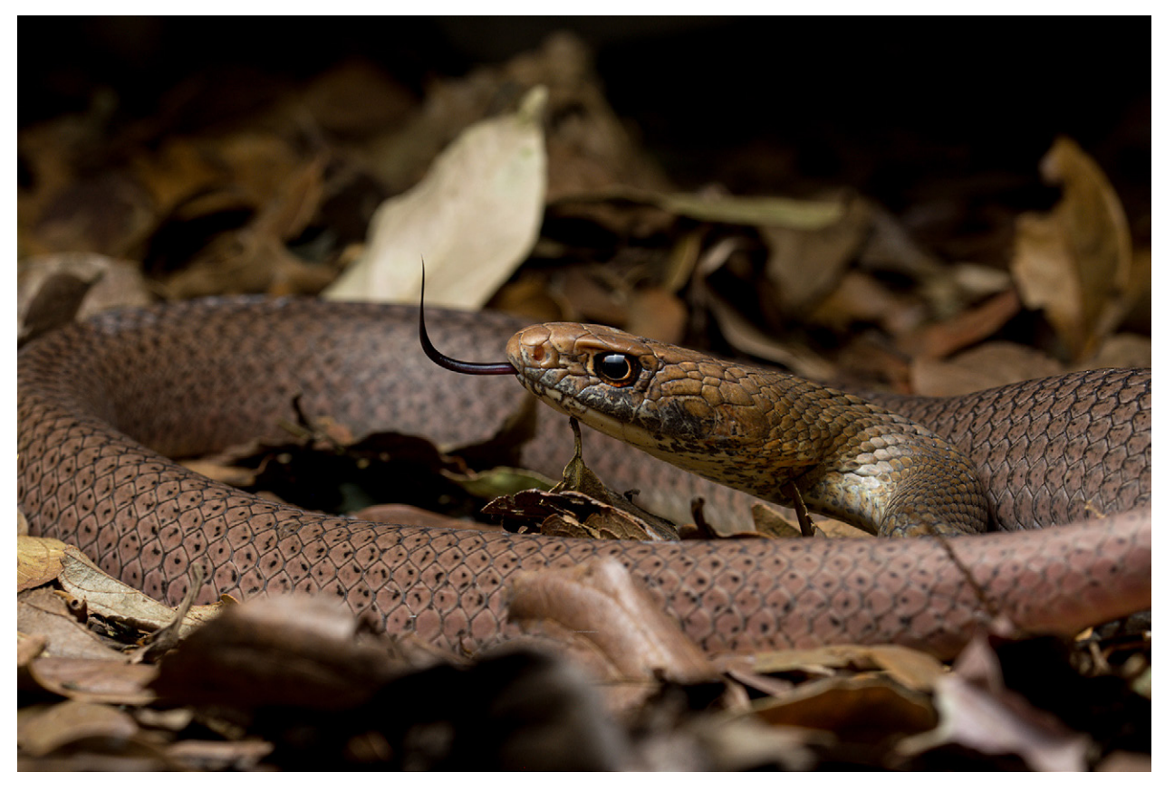
Figure 1. Masticophis mentovarius at Los Llanos de Santa Elena, Monteverde, at 1275 m elevation, Puntarenas, Costa Rica.

Comments. The specimen of M. mentovarius was found in the understory of thicket (Fig. 2). The snake was at the side of a trail, where it was sitting, basking, quiet, and calm (Fig. 1).