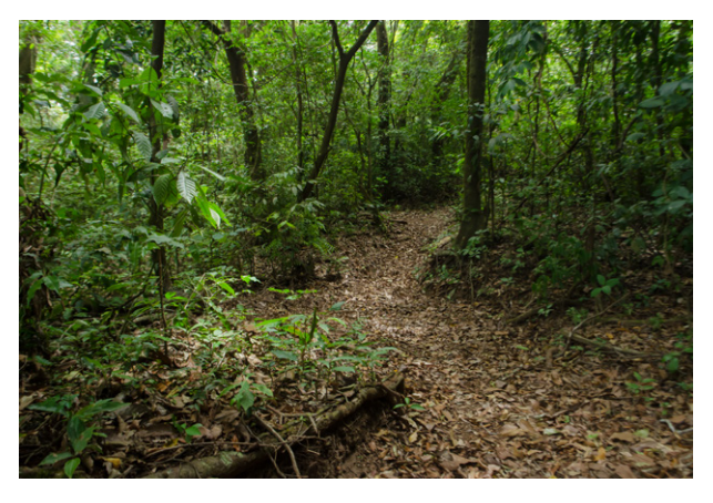
Figure 2. Understory and thicket vegetation where Masticophis mentovarius was found at Los Llanos de Santa Elena, Monteverde, Puntarenas, Costa Rica.

Other data records examined. Individuals of M. mentovarius, from several localities within the dry forest of northwestern Costa Rica and some localities at the Central Valley (Fig. 3), are held in the UCR collection. Elevational extremes for records in this collection are 960 m and 1080 m from San Rafael de Escazú (UCR 13922 and UCR 7213, respectively). There are two localities from Atenas and San Rafael, Alajuela, on the Central Valley (UCR 15543 and UCR 15600 at 500 m elevation, and UCR 6150 at 840 m). All other localities (16) are from the dry northwest from localities between 7 and 920 m a.s.l. There are 45 records for this species in the GBIF database from Costa Rica; most of them are from the dry northwestern lowlands (GBIF 2021). However, only one entry gives elevation. This record is listed as from San José at 335 m a.s.l., but it actually must be from Puntarenas province (the record is "44 miles north of San Jose"; GBIF 2021). One record at the Central Valley is from Alajuela but at approximately 800 m elevation. Another record is from Santa Ana in San José and must be around 850 m elevation, similar to UCR records from Escazú, San José. A record from Cartago at approximately 2500 m elevation (09°41'50" N, 083°54'39"W; GBIF 2021) seems to be a mistake. This record (LACM 103876), as provided by Johnson (1977), may have led