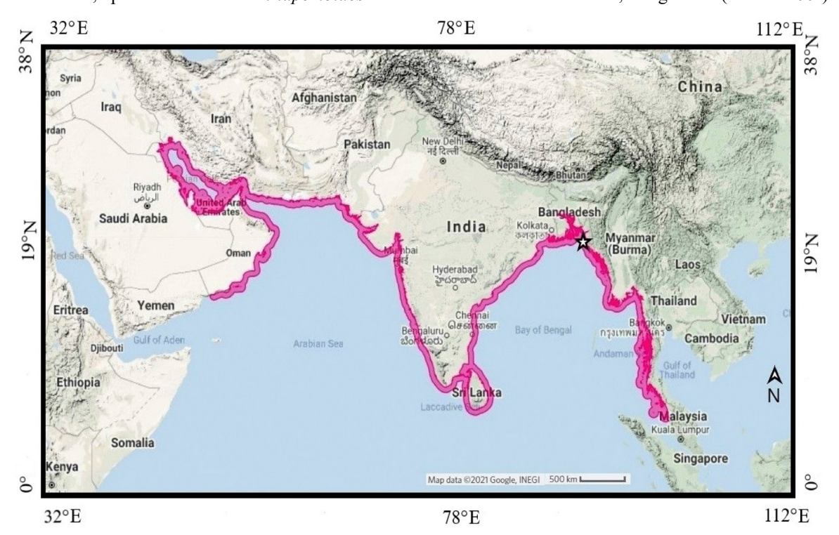
Figure 1. Distribution range of Hydrophis lapemoides from the Persian Gulf to the Malacca Straits. Black star icon depicts the location of current record from Chattogram of Bangladesh (map source: ©2021 Google, INEGI).

The specimens is deposited in the collection of Venom Research Centre, Bangladesh (BAP-HI-001).