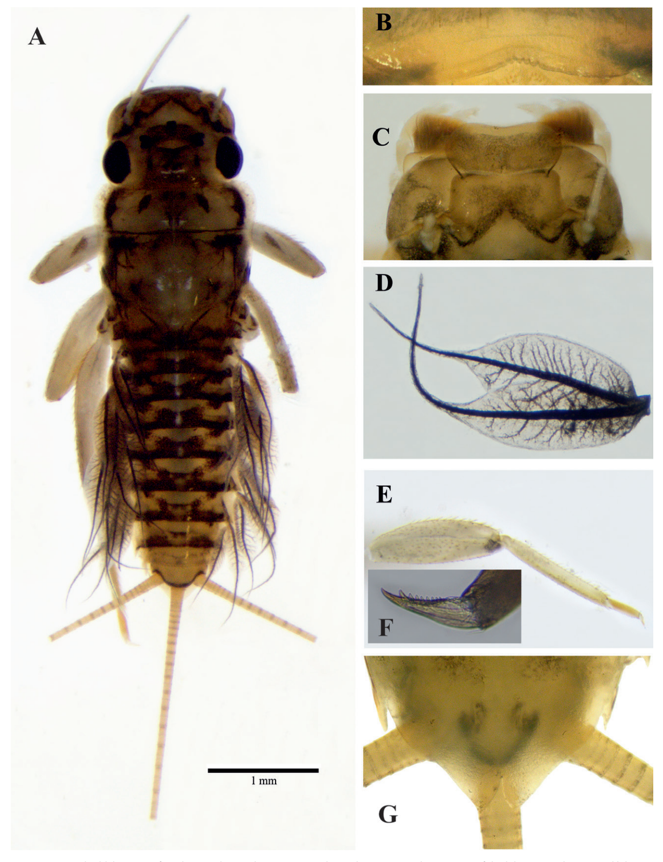
Figure 2. Poecilophlebia pacoi , female nymph A. Habitus. B. Denticles in the anteromedian margin of the labrum. C. Clypeus and labrum in dorsal view. D. Gill of the abdominal segment III. E. Hind leg. F. Tarsal claw, lateral view. G. Sternum IX, ventral view.

progressively larger apically (Fig. 2F) and apex of abdominal sternum IX incised (Fig. 2G); the species is easily recognized by an abdominal color pattern with four distinct dark marks dorsally on each tergum (Fig. 2A).