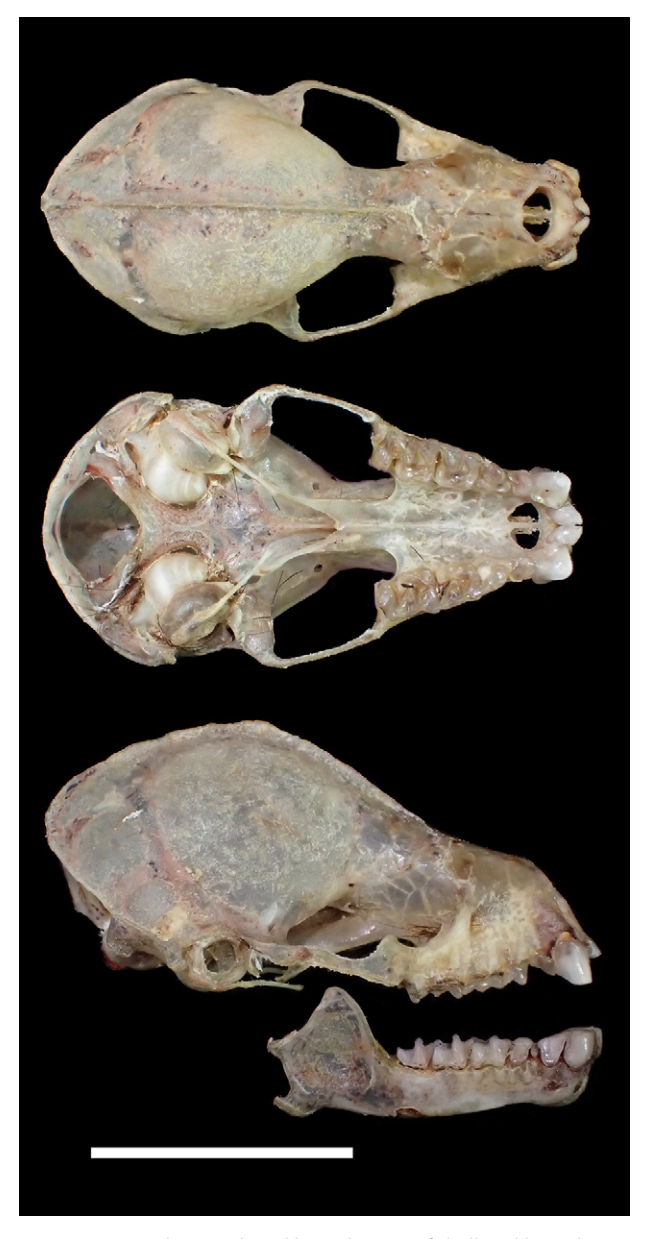
Figure 3. Dorsal, ventral, and lateral views of skull and lateral view of mandible of Lophostoma brasiliense (LMUSP 512) from Caiuá, São Paulo, Brazil. Scale bar = 10 mm.

Lophostoma brasiliense may be confused with bigeared bats (genus Micronycteris Gray, 1866), from which it can be distinguished by having two lower incisors (four in Micronycteris), a well-developed sagittal crest, round warts on the chin (V-shaped pads in Microncyteris), free ears (ears connected by a band of skin in Micronycteris), and a more robust external appearance (Albuja 1999; York et al. 2019). Species of Lophostoma may be externally similar to species of Tonatia Gray, 1827, and some large members of the former genus may show overlap in forearm length with species of Tonatia. However, L. brasiliense is much smaller than known species of Tonatia, which have a forearm measuring between 51 and 62 mm (Williams and Genoways, 2008). Behaviorally, species of Lophostoma show a typical "ear curling" behavior (Fig. 2) which is absent in species of both Tonatia and Micronycteris (Williams and Genoways 2008).