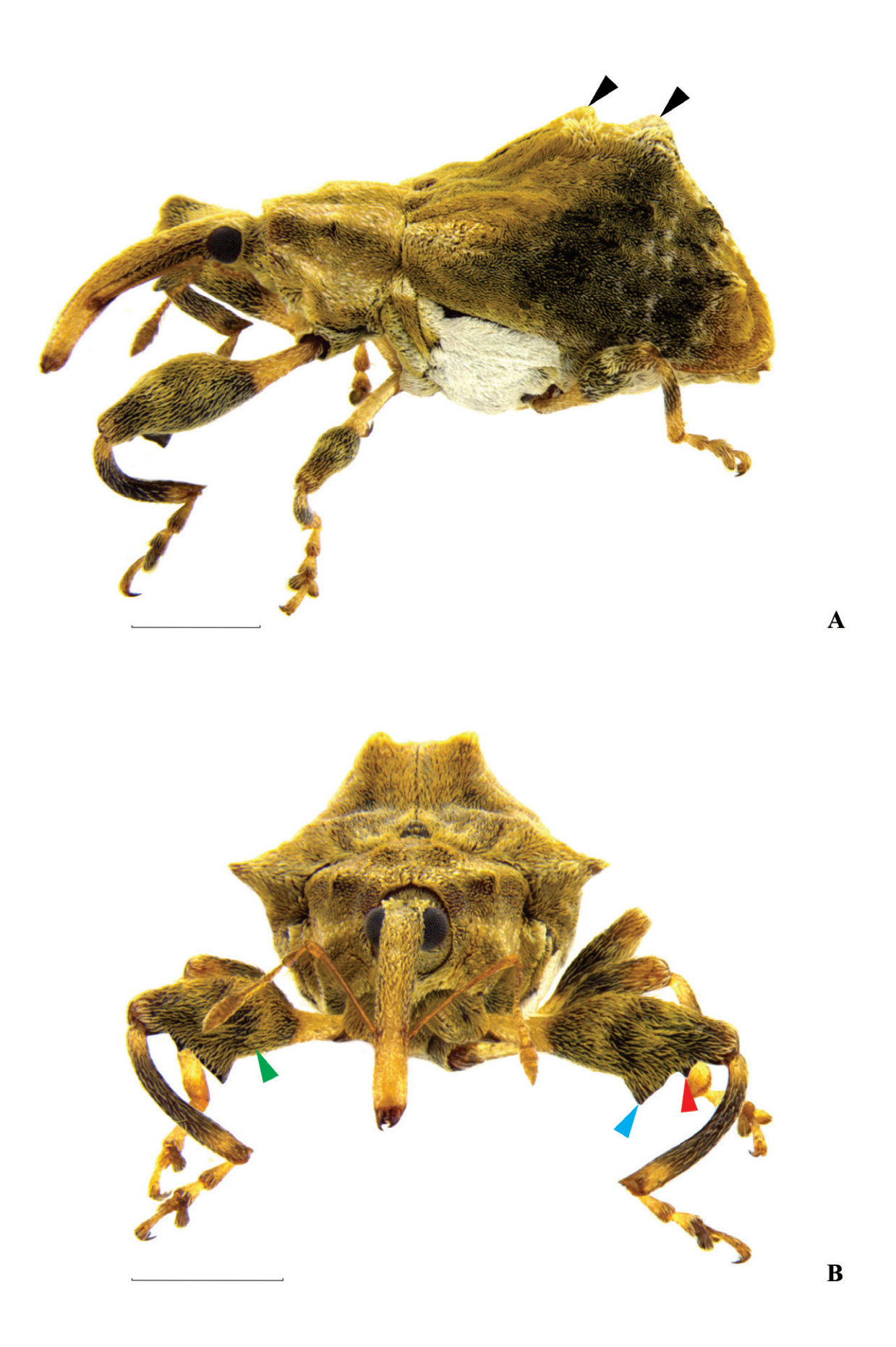
Figure 3. Habitus of Cissoanthonomus tuberculipennis . A. Adult in lateral view, highlighting the strong dorsal protuberances on the middle of the elytra (indicated by black arrows). B. Adult in frontal view, highlighting the greatly enlarged anterior femora (indicated by green arrow) with large toothlike expansion in the ventral region (indicated by blue arrow) and small preapical tooth (indicated by red arrow). Scale bars = 1 mm.