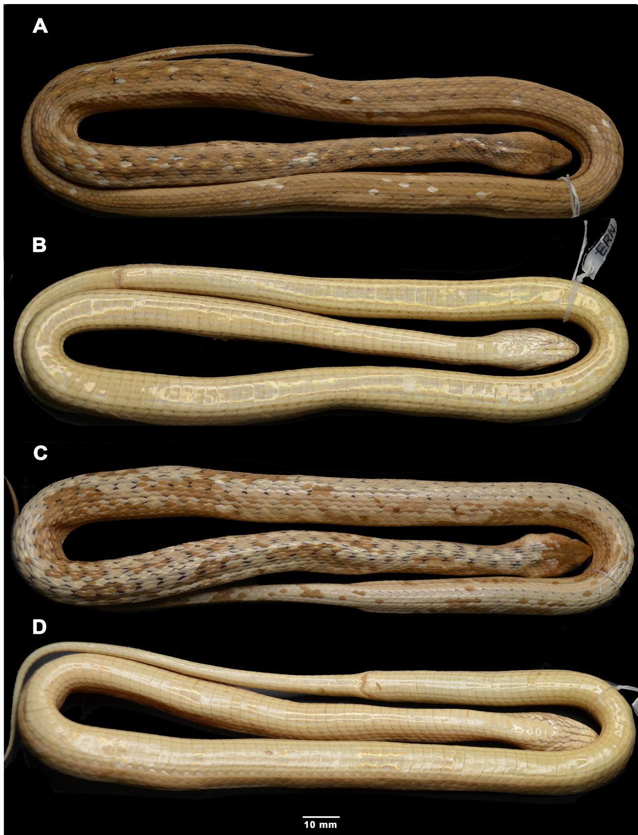
Figure 2. Specimens of Thamnodynastes almae recorded in the Nazareth Ecoresort, Municipality of José de Freitas, state of Piauí, Brazil. A, B. Adult male CHNUFPI(SER) 0116: (A) dorsal view; (B) ventral view. C, D. Adult female CHNUFPI(SER) 0117: (C) dorsal view; (D) ventral view.

lowland and highland species. Sixty species of snakes are known to occur in Piauí, which is few compared to nearby states, and is the result of the relatively less sampling effort in the state (Guedes et al. 2018: fig. 2A, B).