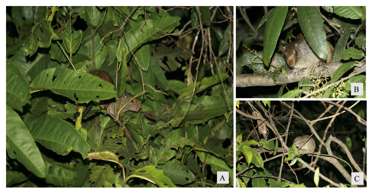
Figure 2. Specimens of Toromys rhipidurus , Peruvian Toro, from Colombia. A, B. Adult individuals. C. Juvenile individual.