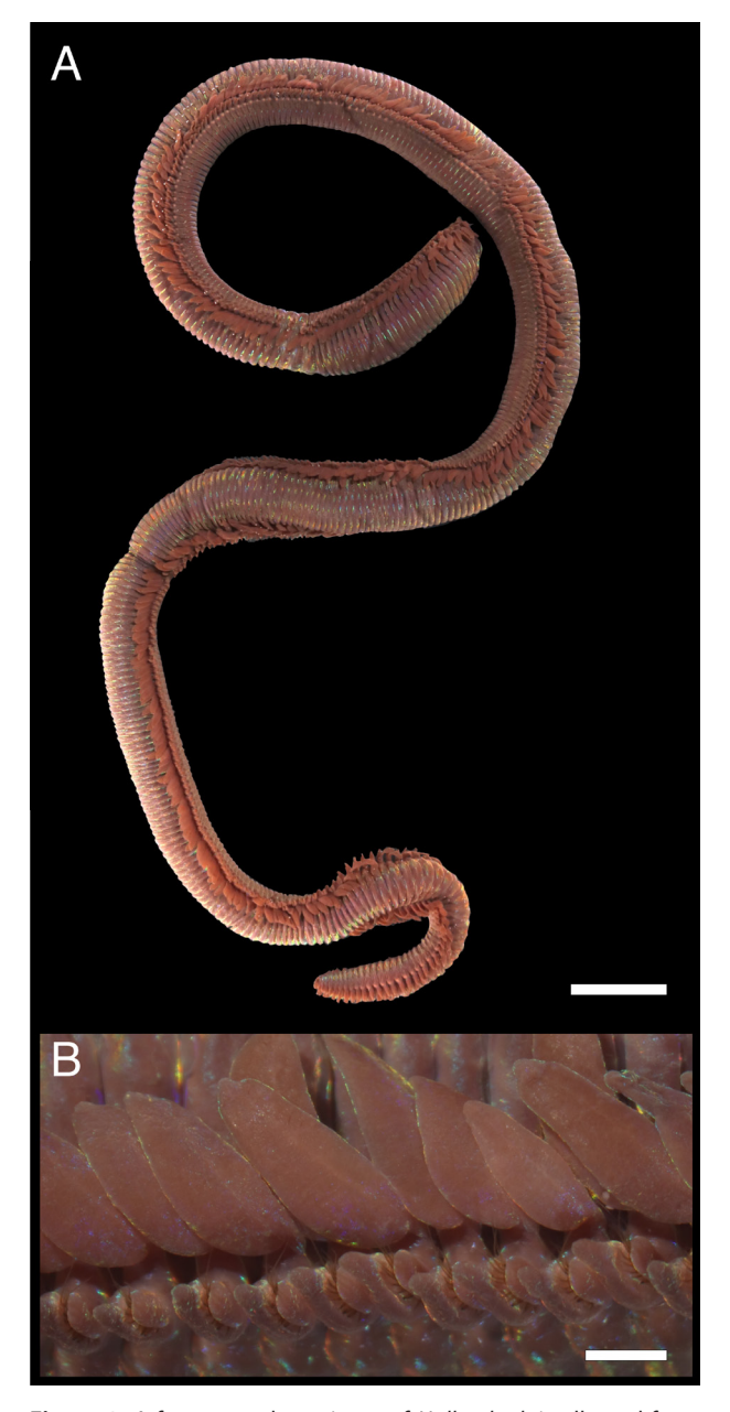
Figure 2. A fragmented specimen of Halla okudai collected from Tomie Bay in the Goto Islands, Japan. A. Lateral to dorsal view of the specimen. B. Parapodia of the specimen. Scale bars: A = 10 mm; B = 1 mm.