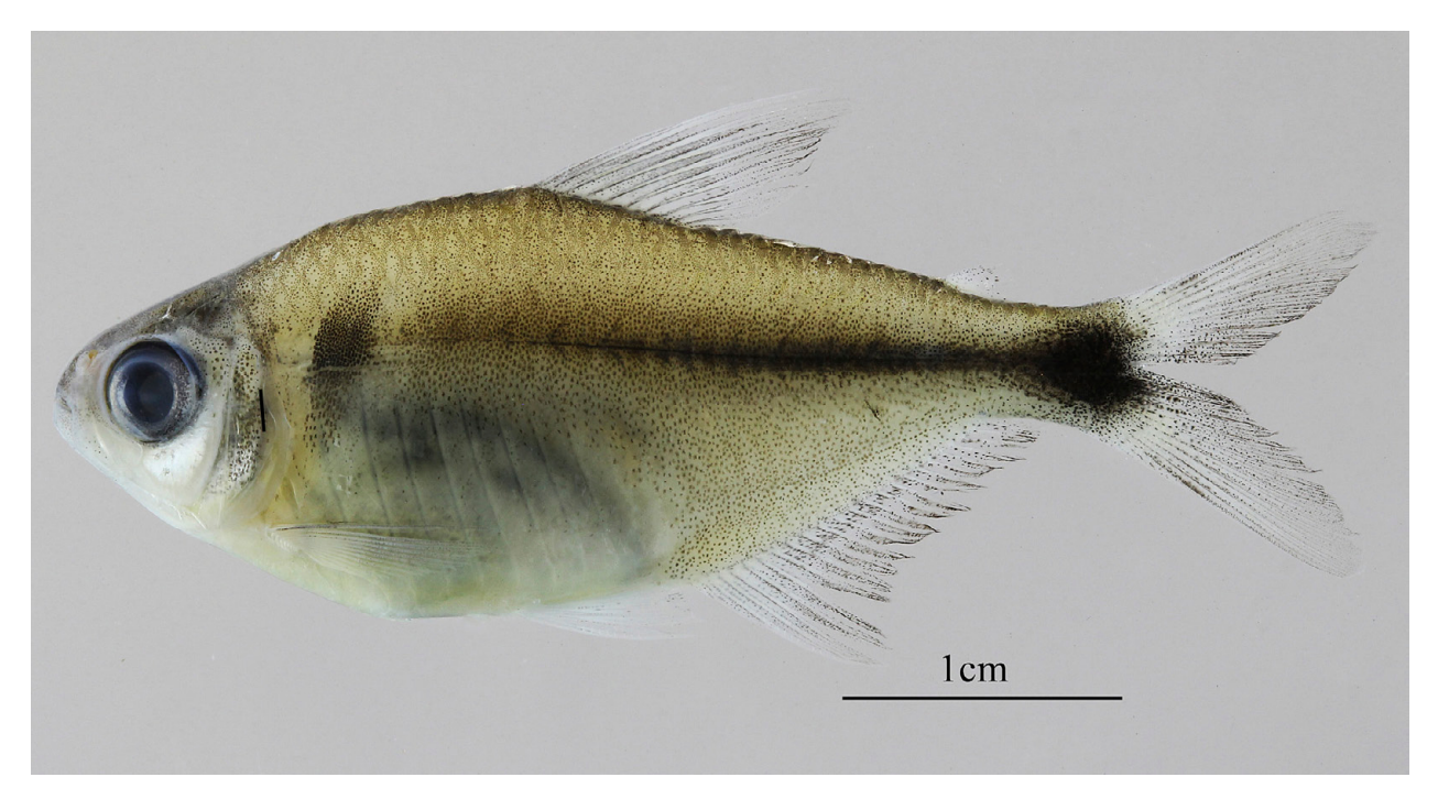
Figure 1. Jupiaba acanthogaster from Indaiá stream, Sucuriú drainage, upper Paraná river basin, Brazil (ZUFMS 05778, 39.9 mm SL).