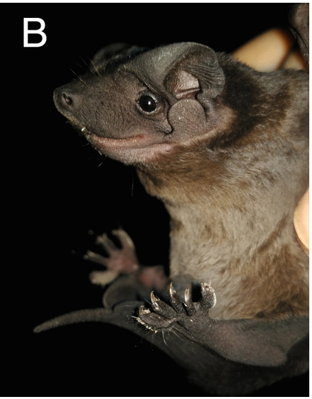
Figure 1. Geographical information and live specimen of Cynomops greenhalli . A. Distribution of C. greenhalli in Costa Rica and neighboring localities. 1, 2. First records from Costa Rica: (1) Heredia, Puerto Viejo, La Selva Research Station (UCR 4802); (2) Costa Rica, Limón, Brisas de Veragua, Veragua Rainforest (UCR 5043). 3–5. Records from Panama based on specimens deposited in the National Museum of Natural History, Smithsonian Institution (USNM): (3) Bocas del Toro, Isla San Cristóbal (USNM 449875); (4) Darién, Jaqué, Rio Imamado (USNM 363108); (5) Darién, Tacarcuna Village Camp (USNM 310264). B. Rostrum and ventral view of C. greenhalli from the Costa Rican specimen (UCR 5043).

the dry forest of the Pacific lowlands, the southern limit of its known geographic distribution (Peters et al. 2002; Pineda et al. 2008; York et al. 2019). Our observations, however, confirm the presence of C. greenhalli in Costa Rica, demonstrating that this species occurs in the Tropical Wet Forest and in the Caribbean of Costa Rica. Our findings are the first confirmed records of C. greenhalli for the country and extend its distribution northwards in Central America, approximately 230 km from the closest known locality in Panama (Fig. 1A). We suggest that photographs of the specimens showing the diagnostic characteristics can help in the revision and future identification of this rare species.