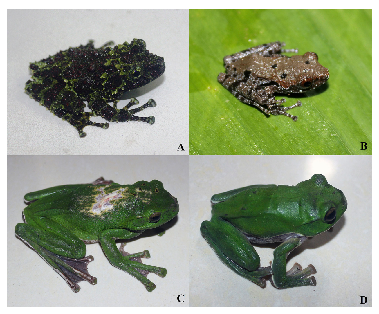
Figure 6. Rhacophoridae of Hai Ha forest, Quang Ninh Province, Vietnam. A. Theloderma corticale (IEBR 4682). B. Theloderma lateriticum (IEBR4683). C. Zhangixalus dennysi (IEBR 4685). D. Zhangixalus pachyproctus (IEBR 4688).

granular; posterior part of dorsum, flanks, dorsal surface and lateral sides of limbs with small calcified spicules; supratympanic and dorsolateral fold absent; throat, chest smooth; belly and ventral surface of thighs granular; dermal appendage at vent absent.