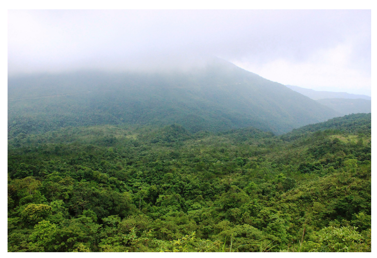
Figure 2. Evergreen forest of Hai Ha District in Quang Ninh Province, Vietnam.

Coloration in life: upper head and dorsum yellowish