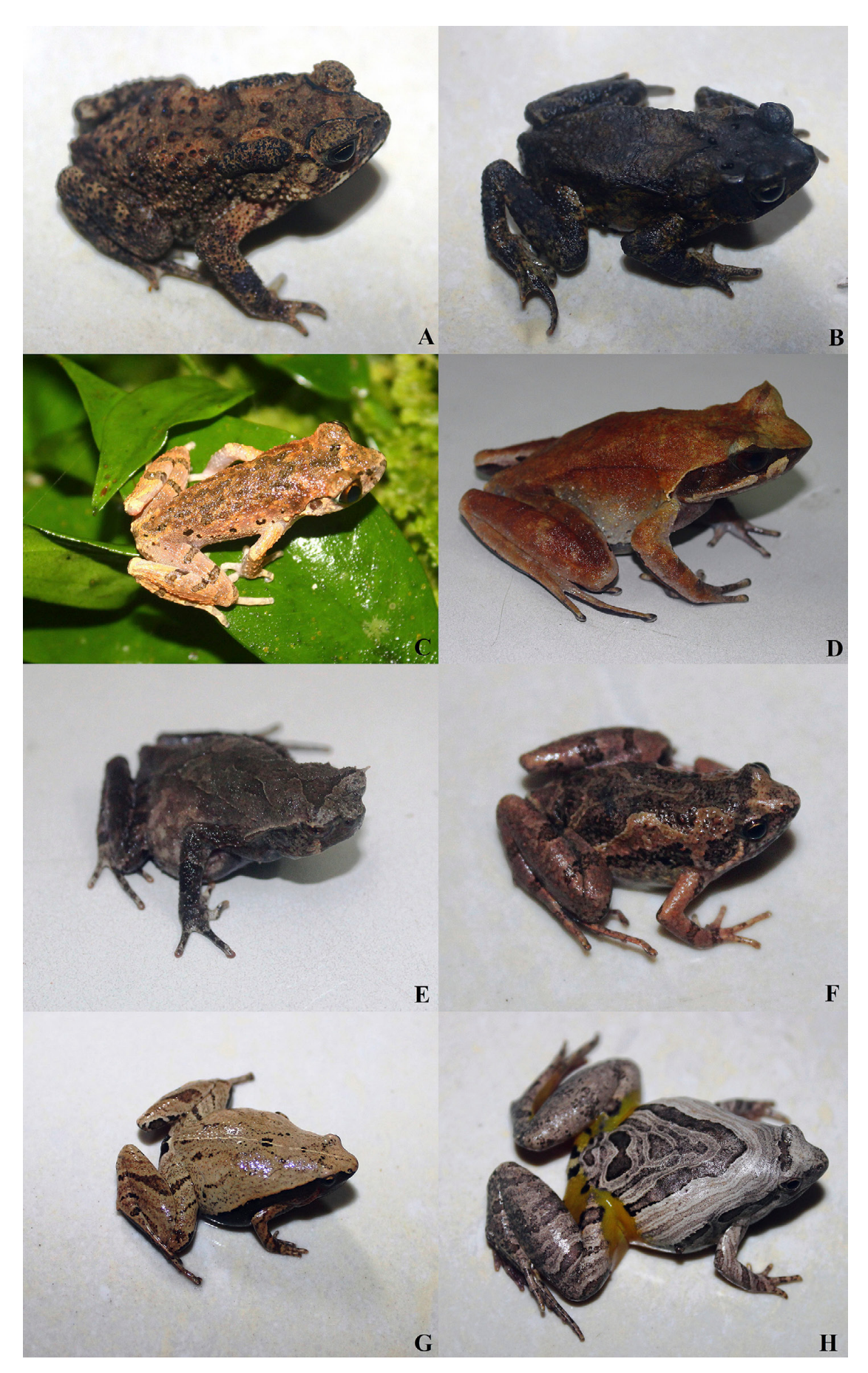
Figure 3. Bufonidae ( A, B), Megophryidae ( C–E), and Microhylidae ( F–H) of Hai Ha forest, Quang Ninh Province, Vietnam. A. Duttaphrynus melanostictus (IEBR 4613). B. Ingerophrynus galeatus (IEBR 4616). C. Leptobrachella minima (IEBR 4620). D. Megophrys maosonensis (IEBR 4628). E. Megophrys microstoma (IEBR 4630). F. Microhyla butleri (IEBR 4632). G. Microhyla heymonsi (IEBR 4634). H. Microhyla pulchra (IEBR 4637).