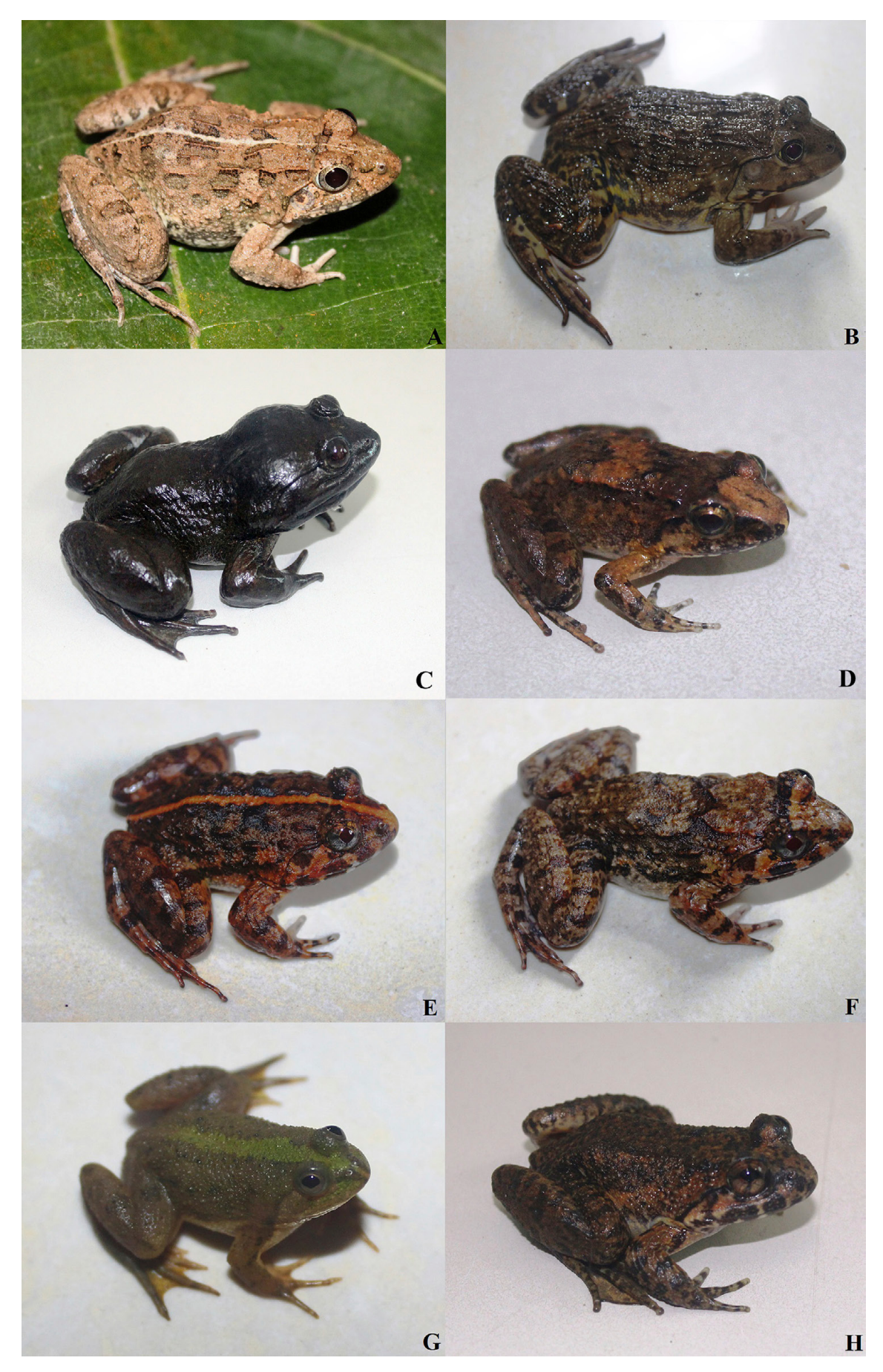
Figure 4. Dicroglossidae of Hai Ha forest, Quang Ninh Province, Vietnam. A. Fejervarya limnocharis (IEBR 4638). B. Hoplobatrachus rugulosus (IEBR 4640). C. Limnonectes bannaensis (IEBR 4645). D. Limnonectes limborgi (IEBR 4532). E. Limnonectes quangninhensis (male) (IEBR 3912). F. Limnonectes quangninhensis (female) (IEBR 3915). G. Occidozyga lima (IEBR 4647). H. Quasipaa acanthophora (IEBR 4648).