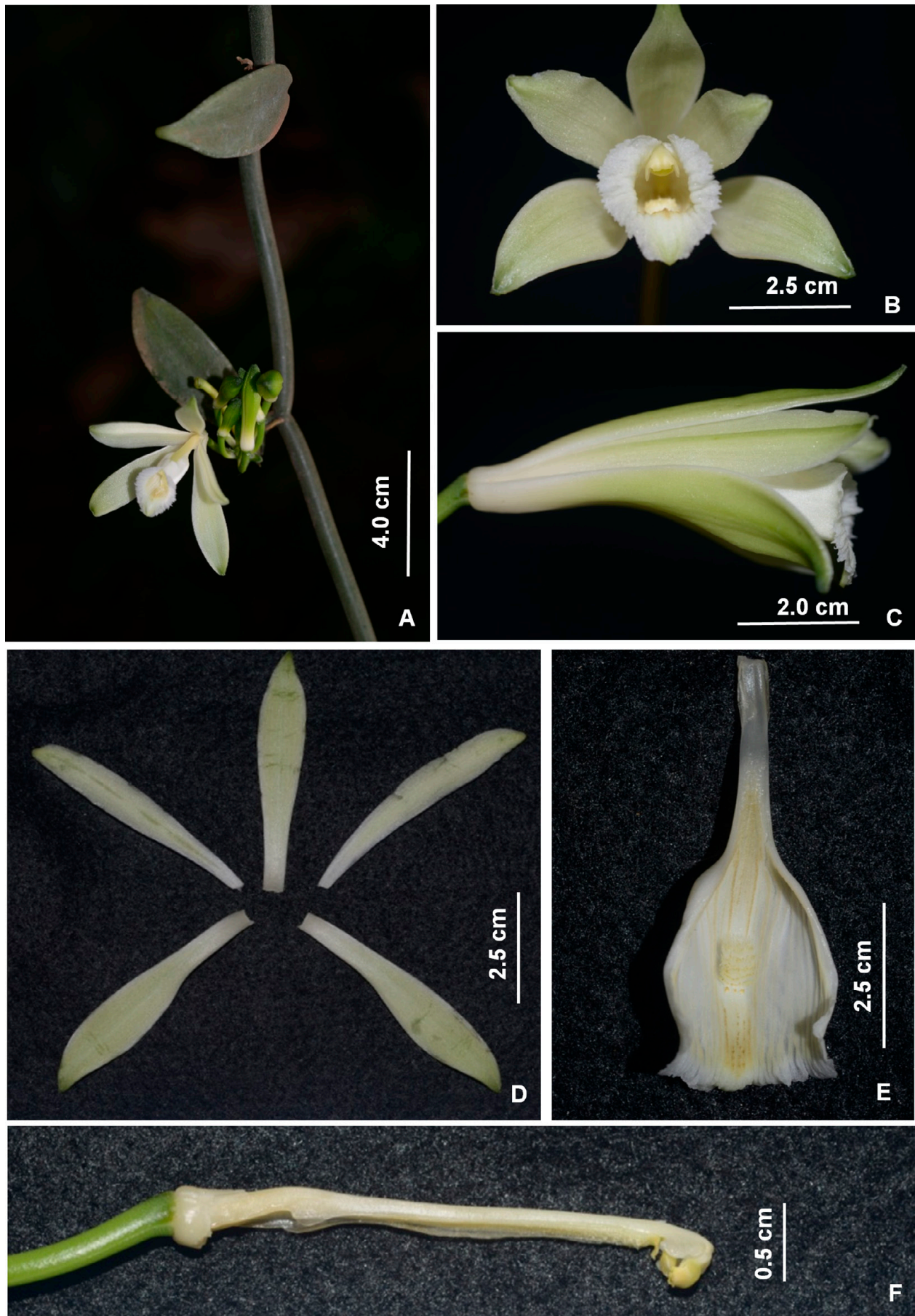
Figure 2. Vanilla hartii . A. Part of plant in bloom. B. Flower in front view. C. Flower in lateral view. D. Part of the dissected perianth. E. Labellum distended showing the penicillate callus. F. Part of the ovary and column in lateral view showing the rostellum and the anther cap.