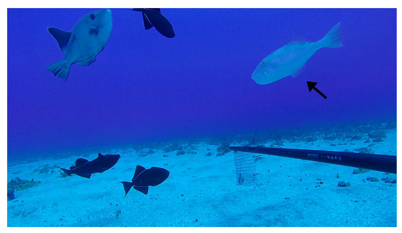
Figure 3. Aluterus monoceros (black arrow) recorded by baited remote underwater video systems (BRUVs) in Trindade Island.

Identification. Brazilian endemic Apogon , pink to reddish coloration, no dark spot beneath second dorsal fin and slight dark spot in the edge of the operculum (Fig. 4). Comparative material: Apogon americanus (CI-UFES 1255, 1407, 2670, 3103); Apogon pseudomaculatus (CIUFES 2727); Apogon planifrons (CIUFES 1246); Apogon quadrisquamatus (CIUFES 1218).