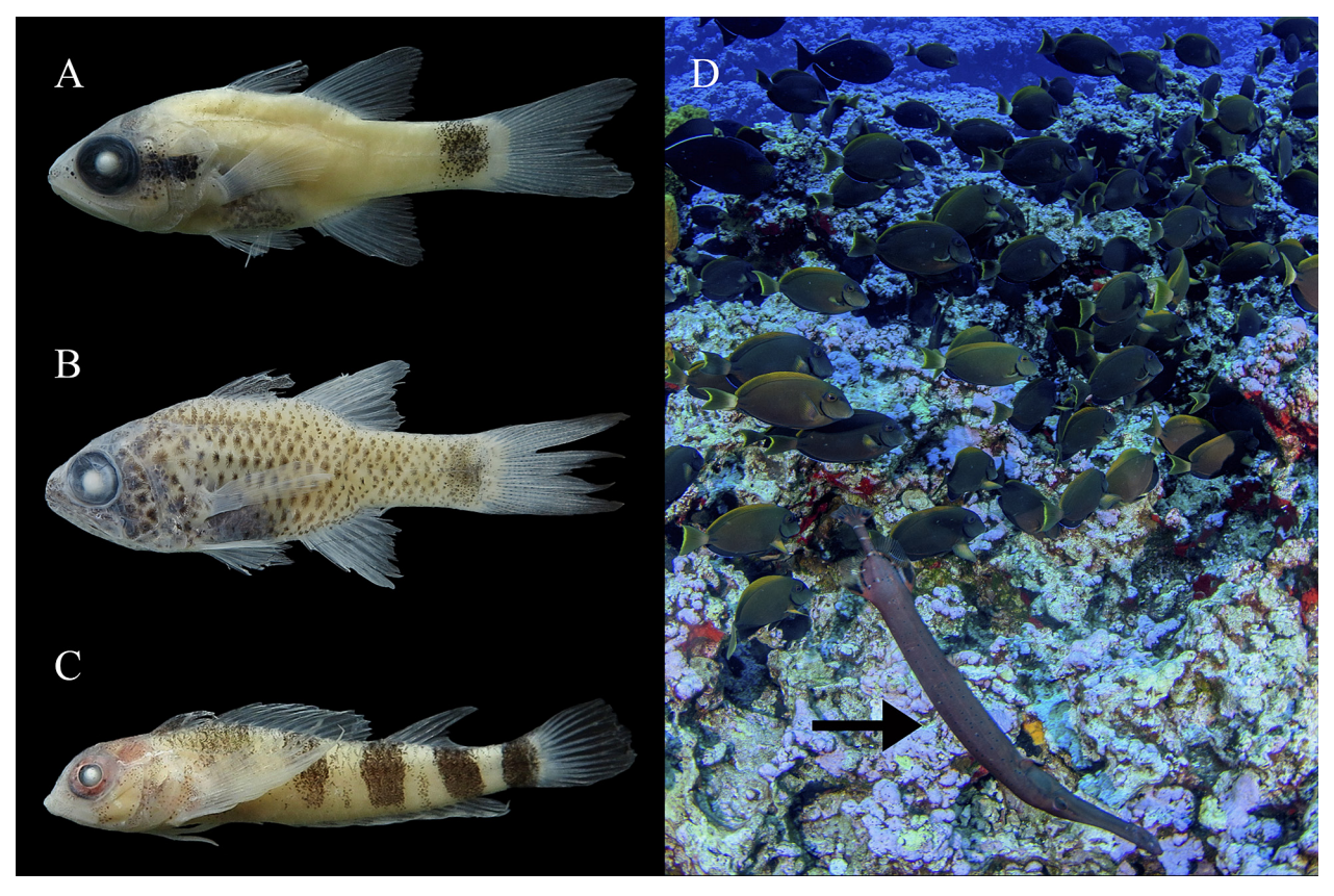
Figure 4. New records of shore fishes for Martin Vaz Archipelago and Davis Seamount. A. Apogon americanus (CIUFES 3339). B. Phaeoptyx pigmentaria (CIUFES 3340). C. Enneanectes altivelis (CIUFES 3342). D. Aulostomus strigosus (black arrow).