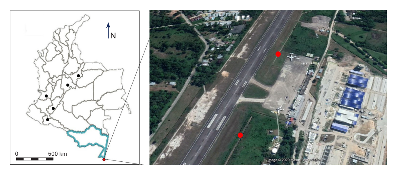
Figure 1. Location map of Mustelirallus erythrops in Colombia. To the left, black points show the approximate locations where the species had previously been reported in Colombia (eBird 2020; GBIF 2020), and the red point shows our report at Alfredo Vásquez Cobo International Airport in Leticia, Amazonas, Colombia. To the right, there is a satellite image of the airport, in which red circles represent the exact locations of our observations in this study.

The shy and furtive character of M. erythrops , and the fact that it did not vocalize when we were nearby, made it difficult to photograph and record its vocalizations. However, over time it became somewhat used to us, so we were able to photograph some individuals at a short distance (ca 3 m) and record an adult vocalizing