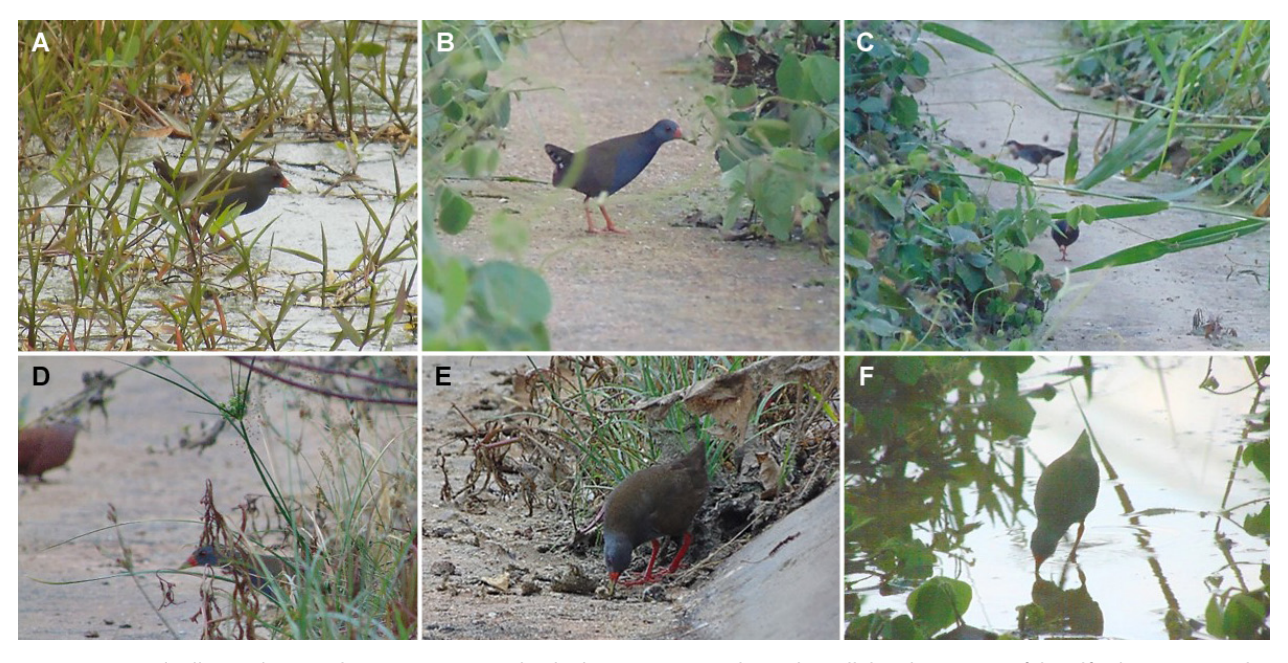
Figure 2. Mustelirallus erythrops (Sclater 1816). A, B. Individuals in a rainwater channel parallel to the runway of the Alfredo Vásquez Cobo International Airport, in Leticia, Colombia: ( A ) June 2016 and ( B ) February 2018. C, D. Individuals feeding in the rainwater channel: next to ( C ) Gray-breasted Crake, Laterallus exilis , and ( D ) Ruddy Ground-Dove, Columbina talpacoti . E, F. Individuals feeding: ( E ) during the dry season, March 2018, and ( F ) during the rainy season, May 2018. Photographs by Arley Gallardo.

Our data confirm the presence of the Paint-billed Crake in Colombia's Amazon region and provide evidence that supports that the Paint-billed Crake has a wider distribution than previously known. In Colombia,